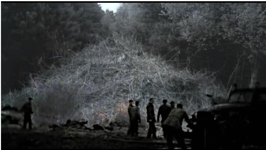
Figure 2: Superposition of an archive footage over a landscape photograph

(SEBALD, 2001, interview for the Bookworm). In these desolate landscapes, in a sense deprived of a deeper human mapping that would condition their perception within specific referentials, the narrator almost literally listens to the objects, remnants, natural elements. He perceives the space not as a blank, but as something that carries and manifests the ruins of all the stories that happened there, as ghosts simultaneously treading the same ground. In Patience , Gee transposes such a perception through the use of overlapping layers of image: for instance, when artist Tacita Dean is telling about the various Sebaldian coincidences that have again and again linked her to a small town in the Netherlands, and her father's story of a cloth map he found after an airplane crash, the filmmaker slowly superimposes an archive footage from the Second World War over the image of a bleak landscape, probably related to the place mentioned by Dean. This happens constantly along the film, and succeeds in translating Sebald's perception of space as a gathering of overlapping fragments of individual and collective stories.