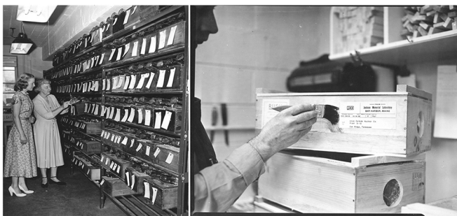
Fig. 1. Historical development of the mouse 'shoe box'. Mouse facility at The Jackson Laboratory in the 1950s, showing racks containing the original double-sided wooden mouse boxes. The original wooden boxes were modifications of boxes used by the Maine blueberry industry to transport berries. In the early days, mice were shipped in wood containers with hardware cloth covering openings on the sides for aeration.

Obesity and type 2 diabetes are a global problem in human populations. This disease has been recapitulated in mouse models, especially when using standardized high-fat diets (Heydemann, 2016).