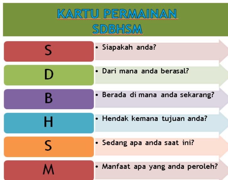
Figure 2. Side B of the SDBHSM (Rahman, 2018)