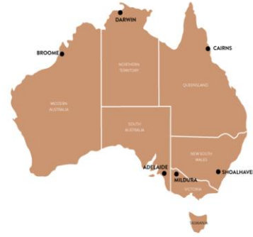
Figure 1: Map of Australia showing locations of the ATSISPEP regional Roundtables (see Appendix 1 for enlarged image)

Roundtables were held in Mildura, Victoria; Darwin, Northern Territory; Broome, Western Australia; Cairns, Queensland; Adelaide, South Australia; and in the Shoalhaven area of New South Wales (Figure 1).