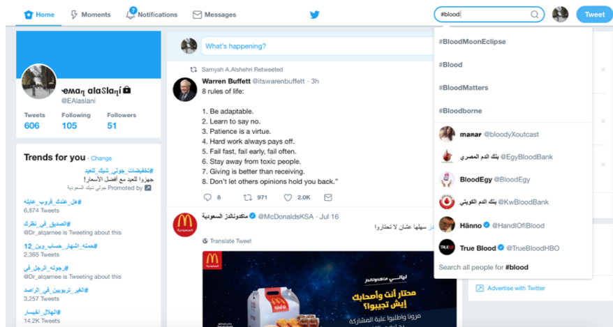
Figure 2. The home page for Twitter application.

Twitter is “powered by people all around the world [and] lets them share and discover what’s happening now” (Twitter.com). This supports McQuail’s (2010) observation that “mass media and society are continually interacting and influencing each other.” Twitter plays an important role to let users discuss international and local news, and it helps them to interact on any topic, analyzing and sharing what is happening around them. Twitter is of “cultural interest (and) fashionable status because of the multiplicity of its functions as a news-gathering and marketing tool” (Ahmad, 2010). However, the various ways of using Twitter makes understanding the uses and gratifications of this specific social media site complicated. Twitter offers a more effective way for "information sharing and for supporting activism and mobilization" than Facebook and other social media platforms (Comunello & Anzera, 2012). Also, due to open Twitter profiles, “Users can both read tweets by users they follow and have access to general discussions through keyword searches known as #hashtags” (see Figure 2) (Comunello & Anzera, 2012) even if they do not follow these users.