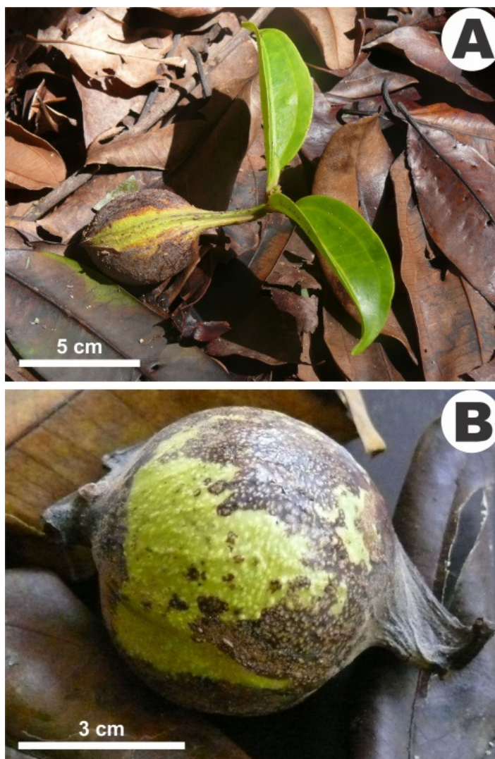
Figure 1. Plant organ abscission and the green island effect caused by an unidentified coleopteran's gall in Miconia cinnamomifolia (DC.) Naudin in Atlantic Forest of Northeastern Brazil. A. Abscised-galled leaf in the forest soil; and B. Gall showing signs of oxidation.