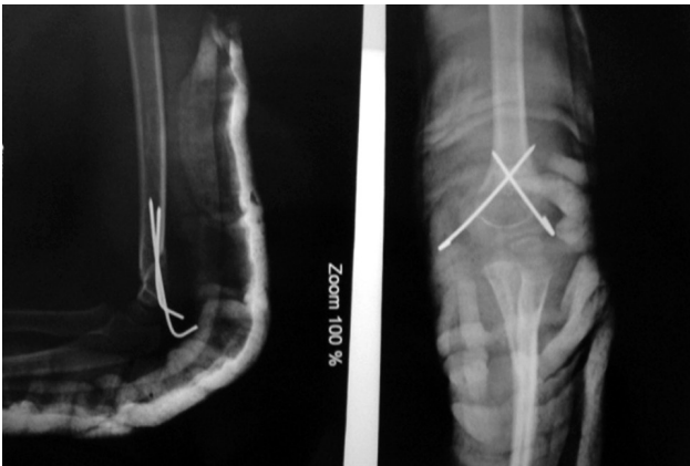
Figure 1. Immediate post operative x-ray after CRPP of fractures humerus in children