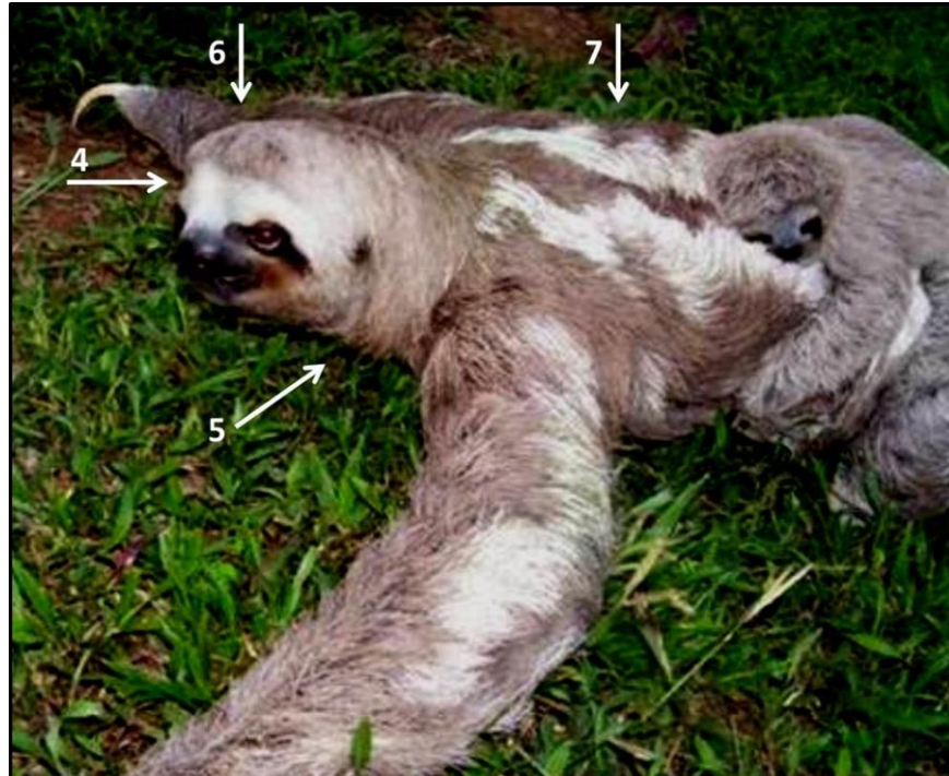
Fig. 2 Female and an infant of the Bradypus found in Yaviza, Pinogana District, Darien Province, Panama. 4-Face and forehead covered with yellow hairs, 5-Throat with yellow coloration and no long dark stripe extending laterally from the eyes, 6-Short hair in forehead, no dark or brown line as occurs with B. variegatus , 7-Black spots, dark stripes or contrasting white-yellowish stripes in the forearm, rear foot and in the back, characteristics of B. tridactylus .