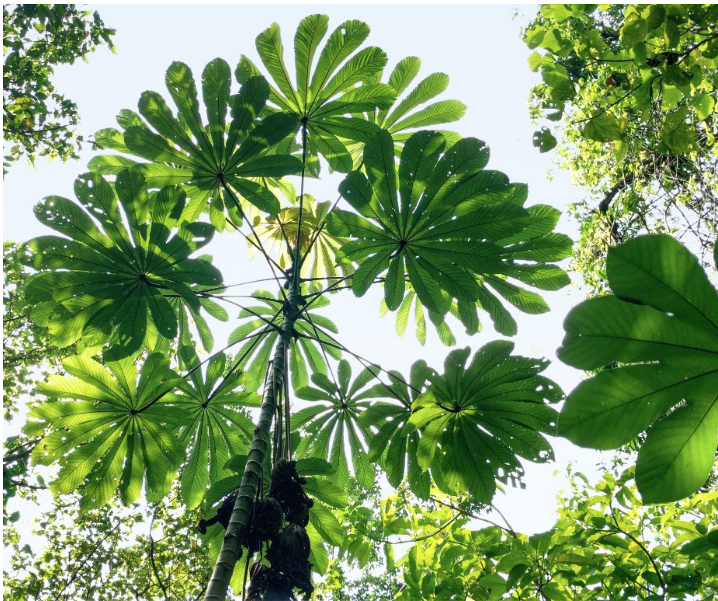
Figure 2: Guarumbo ( Cecropia obtusifolia Bertol). from a plant growing in the “Los Tuxtlas” Tropical Biology Station-UNAM, San Andrés Tuxtla, Veracruz, Mexico.