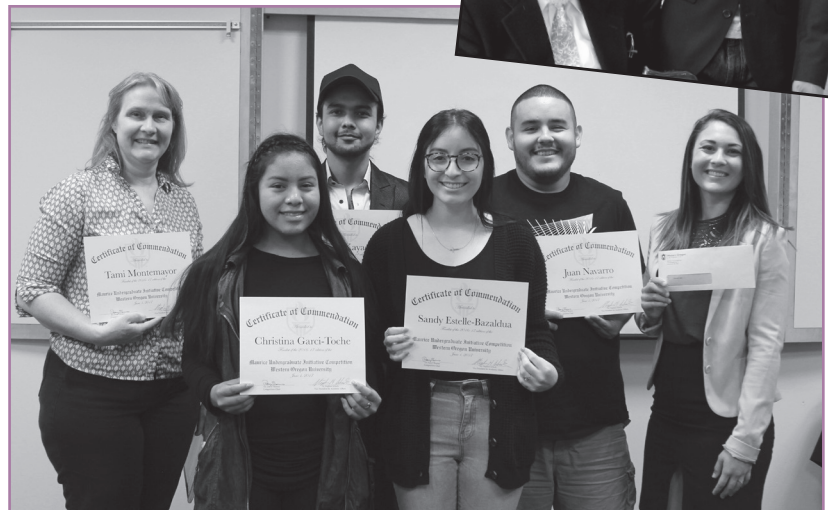
Pictured above: previous student finalists