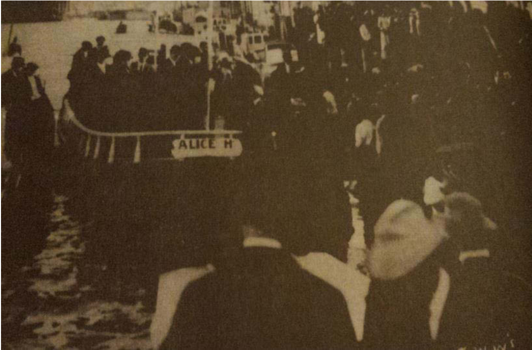
Illustration 2: The deportation of the IWW from Marshfield.