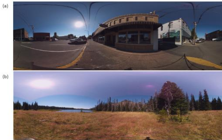
Figure 1. Example images for built (a) and natural (b) environmental simulations, displayed in rectangular format.

continuum. However, results for the PTIA were consistent with H_{2A} , with those with high CNS scores (i.e., CNS scores \geq 3.54 ) indicating more positive implicit affect following exposure to the natural environment versus the built environment.