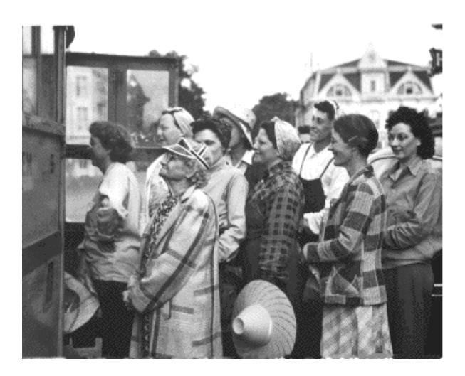
Figure 1: "Women Board a "Housewife Special" Bus to Go Help Save Marion County's Bean Crop, 1944"

Although Oregon producers were easily swayed to take on workers from the Women's Land Army, the state retained the mentality that if a man was available for the same work, he would be hired over a woman. Housewives constituted a large portion of Oregon's Land Army, specifically in Marion County. They worked under a service entitled 'Housewife Special' and were transported by bus from their homes to the fields, returning at the end of the workday back to the home.<sup>41</sup> After the establishment of the WLA, Marion County called for over ten thousand women to work on numerous fruit, vegetable, and hop farms between the months of June and October. An article in the <u>Oregon City Courier</u> declared that "women from 18 to 25 years are the best pickers, doing a better job than men of any age."<sup>42</sup>