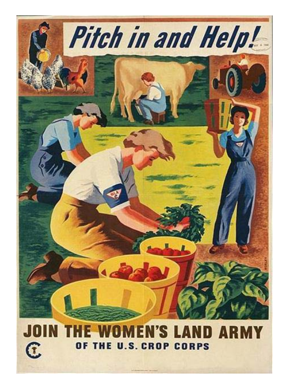
Figure 3: "Pitch in and Help: Join the Women's Land Army of the U.S. Crop Corps" World War II Poster Collection, Northwestern University Library Online Exhibit, http://www.library.northwestern.edu/govpub/collections/wwii-posters/img/ww0870-02.jpg

Figure 2 is an example of the World War II propaganda that was implemented by the Office of War Information in 1943. It utilizes patriotism as a means to motivate women to join the labor force in various areas of work. The poster can also be perceived as an attempt to appease the fears of society because it emphasized the fact that the war cannot be won without the labor of women on the homefront. Women's war work was necessary and patriotic, but not revolutionary. The woman used in the poster is also attractive, physically fit, white, and appears to be of middle-class background.