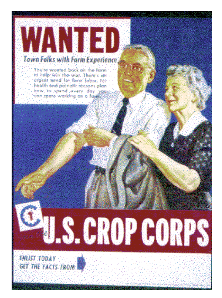
Figure 5: "Town Folks"

not only recruited women to work in the fields, but also men and children. The woman is working with a skirt and seamed stockings, which proves that it was important to the public that women still retain their prescribed clothing attire while doing men's work. The man and boy are dressed in overalls and the boy is showing his patriotism by wearing a military cap. This poster exhibits the preservation of the patriarchy and the importance of the family working as a unit for the war cause. The garden promotes victory because the soldiers can not successfully fight without food, as spoken through the statement in the poster 'our food is fighting'.