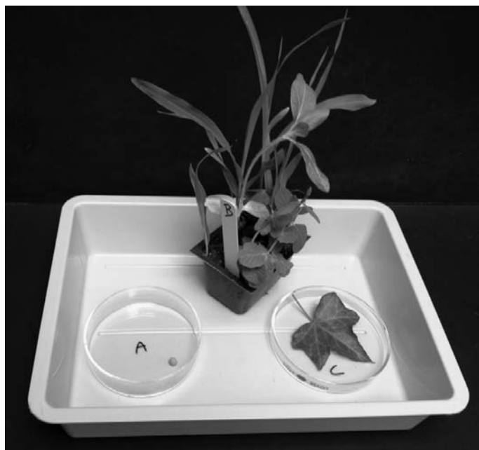
Figure 1. Plant specimens given to students for examination: (A) pea seed, (B) seedling mix, and (C) single freshly cut leaf.

Before beginning this exercise, instructors should introduce the concepts of structural complexity and criteria for being a living organism (Table 1). Typically I do this with a classroom discussion. I ask students