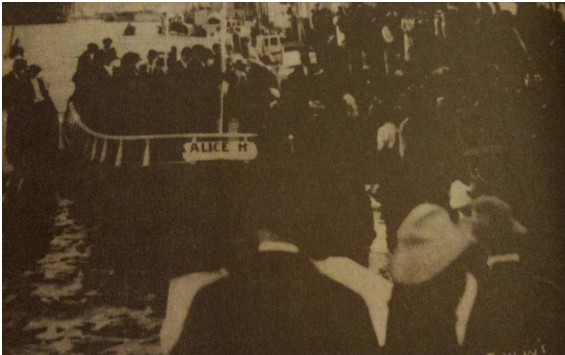
Illustration 2: The deportation of the IWW from Marshfield.