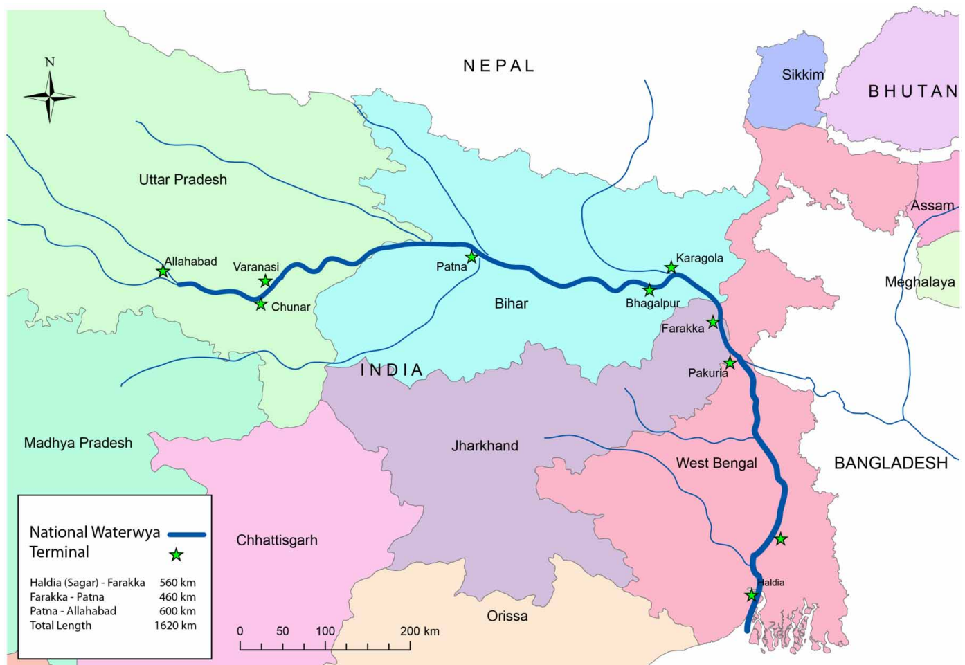
Figure 3 India's National Waterway No. 1.

the GBM river system for water transit between West Bengal and Assam. This protocol is renewed every two years. A navigational link to the Ganges and Brahmaputra could go a long way to expand trade and promote industry and regional development.