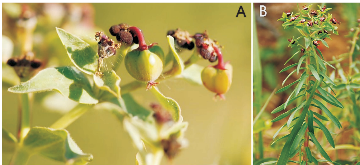
Fig. 2. E. guaraniorum : A , detail of the inflorescence. The whitish pubescence shown here is not part of the plant, but some kind of insect or spider silk; B , habit.

(PY). Misiones: Isla Yacyretá, pista hacia las dunas de San Miguel, 27°27.343' S, 56°48.284' W, 28-X-2010, A. Bogado, M. Quintana & J. Molero 42103 (BCN, MA, PY); Isla Yacyretá, duna de San Rafael, camino del vertedero de Añacua, 27°24.688' S, 56°41.708' W, 90 m, 28-X-2010, A. Bogado, M. Quintana & J. Molero 42106 (BCN, MA, PY).