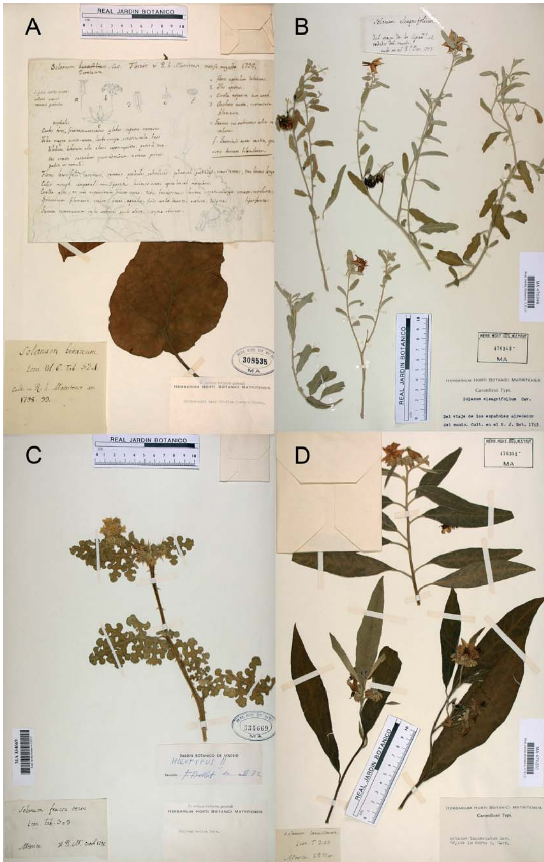
Fig. 1. A, lectotype of Solanum betaceum Cav. (MA 308535); B, lectotype of Solanum elaeagnifolium Cav. (MA 476348-2); C, lectotype of Solanum fructo-tecto Cav. (MA 334669); D, lectotype of Solanum lanceolatum Cav. (MA 476351).