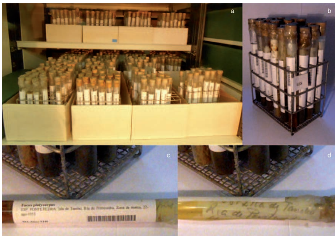
Fig. 1. González Guerrero's Algae Collection in its current location: a , partial view, arranged in shelves, boxes, and racks; b , rack; c , tube (MA-Algae 9340) showing label produced from the database; d , tube (MA-Algae 9340) showing original label inside.

Protologue citation follows the TL-2 (Stafleu & Cowan, 1976-1985; Stafleu & Mennega, 1992-1998) and B-P-H (Lawrence & al., 1968; Bridson & Smith, 1991) abbreviations. When specimens which collection details matched those provided in the protologue have been found, their herbarium accession numbers have been included. These MA-Algae specimens constitute original material, most probably were used by González Guerrero in his original descriptions, and are therefore ideal material for lecto or epitypification purposes. In a few cases, dates shown on herbarium labels do not correspond exactly with those provided in the literature. In these instances, we discuss the possible cause of errors on tube labels or in publications. The list of published names is provided; we have included 3 names written on the herbarium labels but never published.