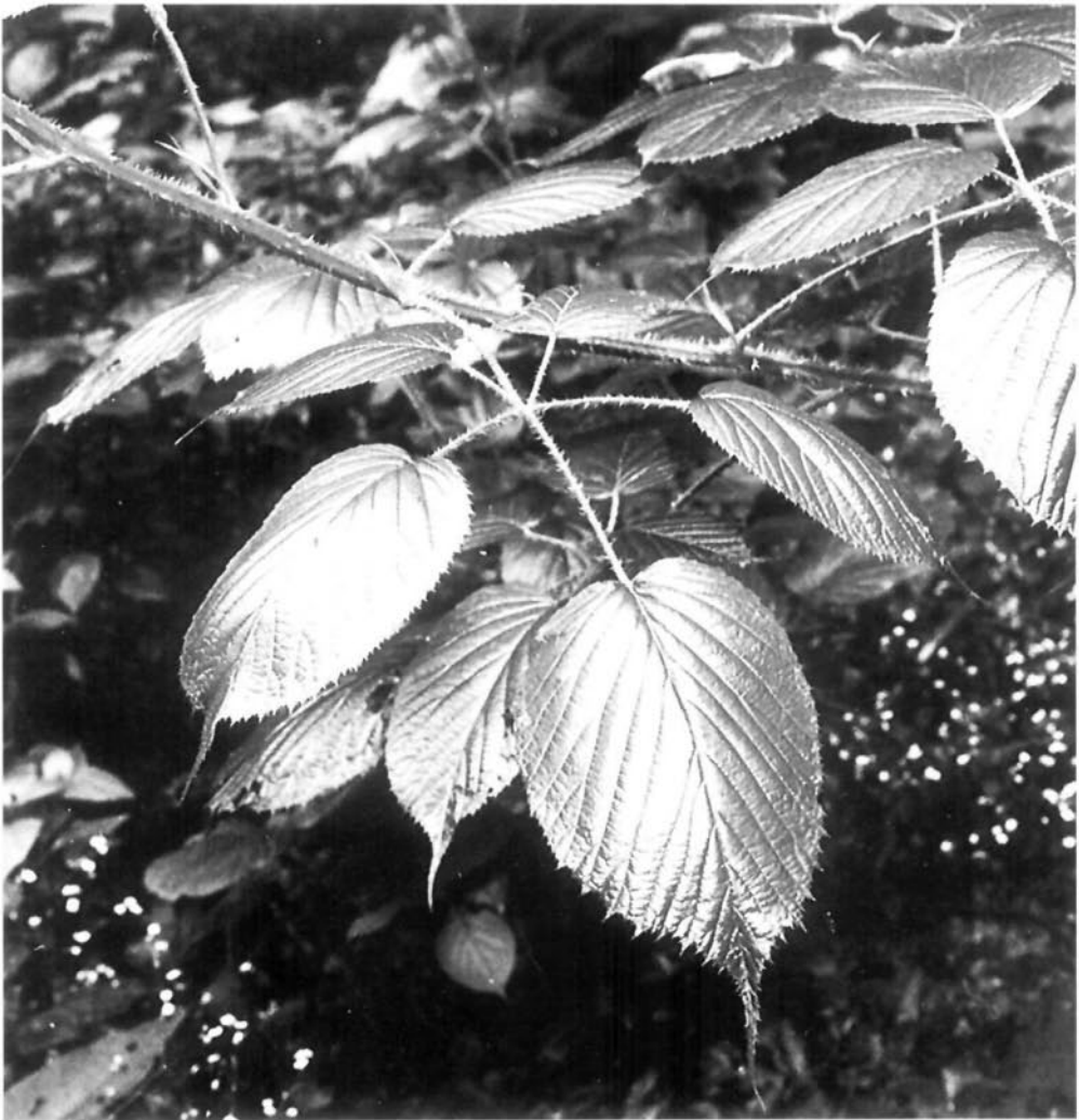
Fig. 3.— Rubus palmensis : Bco. de la Galga, La Palma, 1998, G. Matzke-Hajek.

The "La-Palma-Blackberry" belongs to the series Grandifolii Focke, a group represented