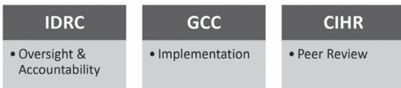
Figure 1. The DIF-H Consortium Model

A three-party consortium implemented the DIF-H. It includes IDRC, the CIHR, and GCC. Each plays a discrete role. GCC is a purpose-built, not-for-profit organization directed by the Government of Canada to be the DIF-H implementation arm, responsible for the delivery of the identified policy priorities and the monitoring and evaluation of the funded projects. The CIHR, Canada's national health research funding agency, is responsible for organizing the competitive scientific peer review of applications to the fund. IDRC, a Crown corporation of the Government of Canada, is responsible for advising the Canadian government on the progress of the DIF-H, disbursing funds to GCC, and managing the evaluation and oversight of the DIF-H as a whole (see Figure 1). Since it is not the purpose of this practice note to describe the DIF-H or the concept of Grand Challenges for Development, we encourage interested readers to review the website of GCC and IDRC to learn more about the DIF-H, and the Grand Challenges for Development website to learn more about the global Grand Challenges effort. 2