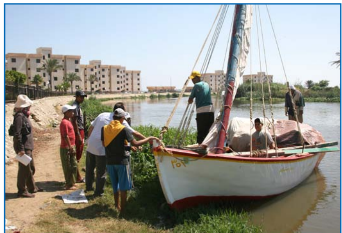
Many activities in the Nile Delta, including fishing, are vulnerable to climate change