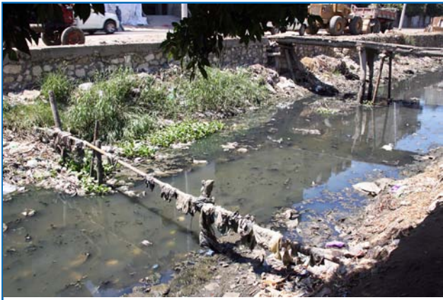
Deterioration of drainage channels in the Delta may worsen the impact of high groundwater levels

vulnerability and adaptation in the Delta; this alone has increased the existing literature by 25%. This work has generated knowledge on climate change vulnerability and adaptation in a wide range of disciplines, including marine biology, agricultural and livestock productivity, wetland ecosystems, health, environmental economics and urban resilience. ARCA is also publishing a quarterly working paper series that highlights research findings.