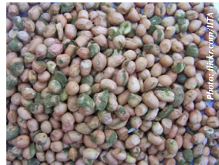
Aspergillus flavus infected groundnuts. Aflatoxin contamination is a key PH issue

roasting, boiling, and pounding for home consumption, or sale in street markets and kiosks. Bulking for oil extraction or export is also undertaken. Whereas potential for export (to Europe and the Middle East) exists access to this export market is limited by quality issues related to aflatoxin contamination and the size of nuts.