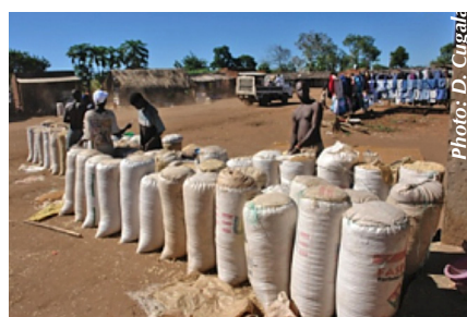
Spillage losses during bagging

Cereals: Maize is the main cereal crop. Smallholder farmers control over 95% of total production. Maize production is more intense in the northern and central parts. Poor roads and high transport costs, however, limit spatial trade with the deficit southern region; the deficit in the south is covered by imports from South Africa.