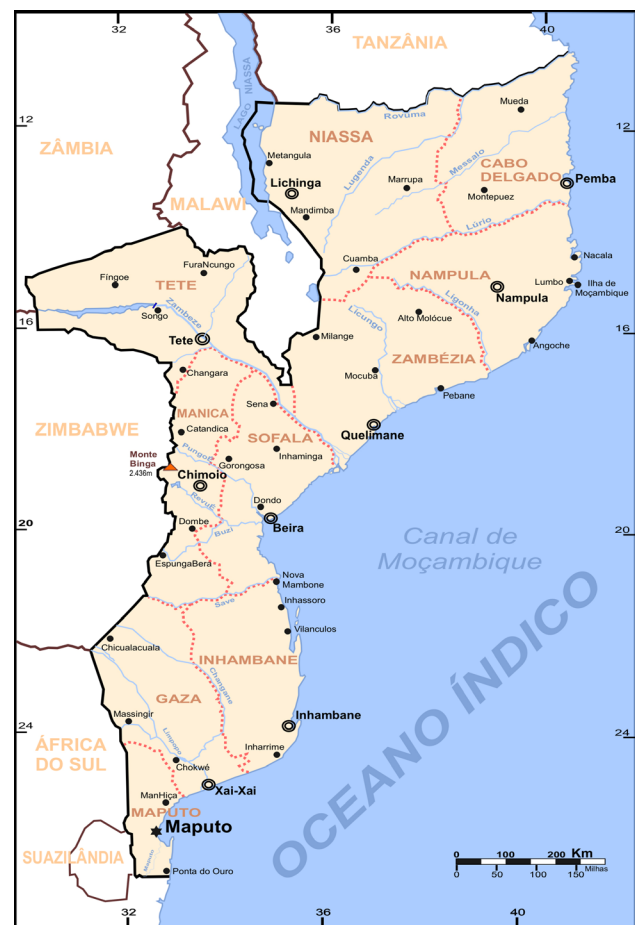
Fig. 1: Geographical location of Mozambique. Mozambique is in southeastern Africa bordering the Indian Ocean

There is uncertainty on the level of PH losses in Mozambique. A systematic review of original studies was carried out by International Centre of Insect Physiology and Ecology ( icipe ) with finan-