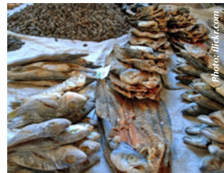
Dried fish products in the market

Fish: Fishing is important as a source of food and income. Chain actors include industrial, semi-industrial, artisanal and small-scale players. Markets for fish products depend on commercial value, quality and region. Industrial and semi-industrial actors dominate export markets (Europe, Asia). Demand in these markets constitutes high quality shrimp, gamba and lobster. Downgraded products are sold locally. Small-scale and artisanal fishermen, who account for about 80% of the total catch, supply the local market. The small-scale and artisanal fishermen operate either as individuals or in small organised groups but generally, their economic and input capability is weak. Sun-drying, smoking and salting are the commonest processing methods especially in northern and central parts of Mozambique, where local market for such processed products is more expanded. The national distribution system for fish is poorly developed. Inadequate handling, poor transportation and storage infrastructure are among the constraints.