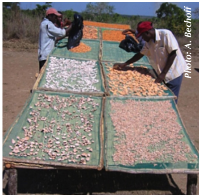
Sun-drying of sweetpotato chips

Root and tuber crops: Cassava is the second most important food crop after maize. Over 70% of smallholder farmers (generally in Cabo Delgado, Nampula, Zambézia and Inhambane) cultivate cassava for household subsistence. About 30% of cassava is processed into flour and roasted grits ( rale ). Almost all processing is done at farm level. Processing tools are quite basic. Improved processing technologies such as chippers and grating machines were introduced, but adoption was low because of high costs of acquisition and maintenance, and the local perception of the resultant product did not match local preferences. Sweetpotato is produced in almost all regions for subsistence. Only minimal processing (at household level) is done.