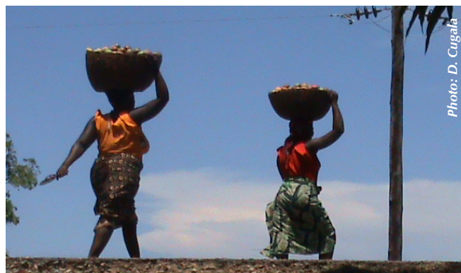
Women undertake most activities in PH chains

Building local knowledge of value chains is needed for systematic assessment of losses and identification of appropriate innovations. Apart from establishing commodity paths, understanding the volumes moved, processes involved, the people/groups/organisations involved and their activities, goals, motivations, and behaviours will be of essence. This will also reveal factors that influence the decisions taken at production, distribution, marketing, processing, etc. This detailed analysis of value chains will help to assess loss magnitudes accurately, and to identify interventions that are problem-centered and socio-economically appealing using participatory means. The participatory component would, therefore, need to feature at three levels: (i) participatory diagnosis of key PH problems and constraints at different levels of commodity value chains; (ii) participatory inventory of existing strategies to mitigate identified problems and constraints, including baseline information on their uptake; and (iii) participatory development of loss mitigation strategies for specific commodities.