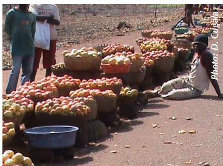
Roadside markets for fruits are common

Fruits and vegetables: Bananas and mangoes are among the most important fruits. Their production is mainly by smallholder farmers, but some commercial producers for urban and export markets are found in Maputo, Manica and Nampula provinces. The advent of the fruit fly in Mozambique forced a ban on banana and mango to export markets. Postharvest value addition activities are quite minimal. Cabbage and tomato are important vegetables. They are produced by both subsistence and commercial farms. Mozambique is, however, a net importer of tomato and cabbage. Value addition for these commodities is minimal. Lack of consistency in quality and supply, inadequate PH extension on handling, poor linkage to