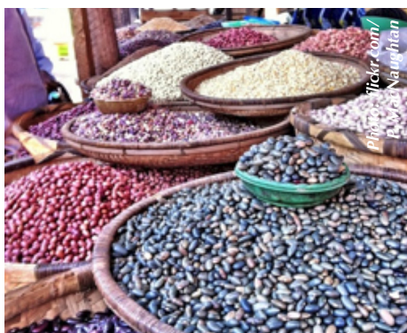
Beans and pulses at a market in Malawi

Pulses: Beans are the most important grain legume in Malawi. Smallholder farmers produce 80% of the beans produced whereas commercial farmers produce 20%. About 75% of bean harvest is sold in local informal markets for domestic consumption whereas 25% is sold to trading companies. Beans are exported to Zimbabwe and South Africa and are also traded through informal cross border channels with Zambia, Mozambique and Tanzania.