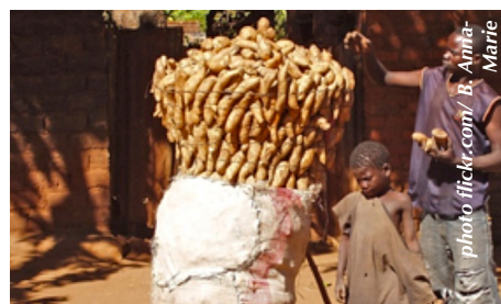
A smallholder farmer prepares sweetpotato for market

Root and tuber crops: Cassava and sweetpotato are important food crops in Malawi. Regarding cassava, over 70% of production is consumed at household level and 30% sold for off-farm consumption and starch processing. Delayed harvesting, improper handling and delays in delivery of sweetpotato and cassava to markets result in deterioration of the crop. Processing of these commodities is limited, and concentrated at the small-scale level.