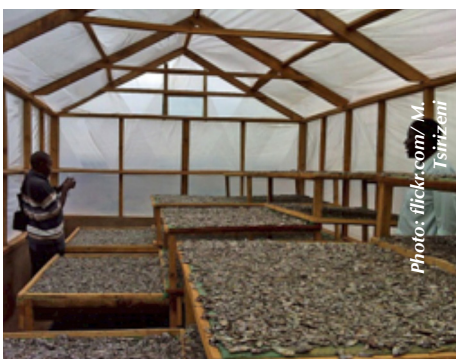
Solar drying of fish at Kachulu Beach

About 90% of the fish from capture fisheries is preserved by means of smoking or roasting (40%) and sun-drying (50%), whereas only 10% is handled and sold in fresh, chilled and frozen forms. A number of processing facilities are used, ranging from the traditional type, like dug-out smoking ovens and drying racks made of reeds and mats to the improved facilities such as Bena kiln (modified Ivory Coast kiln) and wire drying racks. Fish distribution modes are diverse, but many are rudimentary. Modes of transportation range from bicycles to lake steamers, public bus services to private trucks/pick-ups. Generally, handling, processing, value adding and marketing inefficiencies due to lack of facilities and technical knowhow contribute to losses. Furthermore, fish processing and quality management are not well developed due to a shortage of skilled personnel.