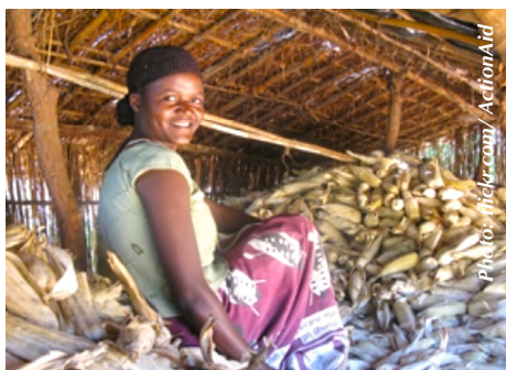
A farmer in her maize granary

group of primary assemblers and transporters, before reaching the silos and warehouses owned by major actors in the supply chain, and eventually the consumer. Large-scale maize millers process maize mainly into maize meal, while a small fraction goes to brewing and animal feed processing. There is an export market in Zimbabwe, South Africa, Zambia and Mozambique during surplus years. Maize is also imported from most of these countries during years of low domestic production.