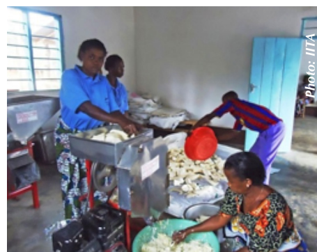
A small group trains on how to use a motorised grating machine for cassava processing

Increasingly, agricultural products are not consumed in their raw form, and postharvest activities such as transportation, storage, processing and marketing are becoming important parts of commodity value chains. Whereas not many technologies other than storage-related ones are documented as having been transferred