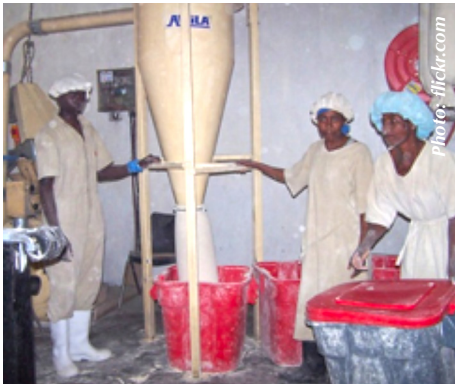
Participation in value addition processing would expand access to new markets

processing has not been realised in Malawi. The reason being that many agro-processing technologies are still limited to farm- or household-level, and, therefore, the economic incentive for uptake is low. Upscaling will enable more to benefit from processing as a value addition tool. The transfer of upscaled processing innovations will require training and capacity building. This could be achieved through establishment of 'learning centres' and stronger policy advice. Transfer of technologies will further require increased access to affordable credit services. Farmers who are organised into business units (farmer groups or SMEs) are better adapted for uptake of innovations as they could enjoy economies of scale, access to credit services and markets, shared risk and stronger negotiating power. Thus, future innovations intended to reduce PH losses should target such organised groups as opposed to individual smallholder farmers.