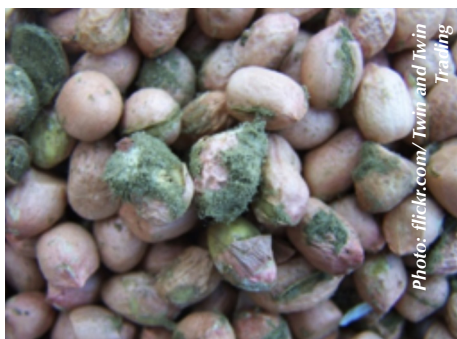
Aspergillus flavus infected groundnuts

Oil crops: Groundnut is the second largest crop produced by acreage in Malawi after maize. It accounts for 25% of the income of smallholder farmers. The main growing areas include