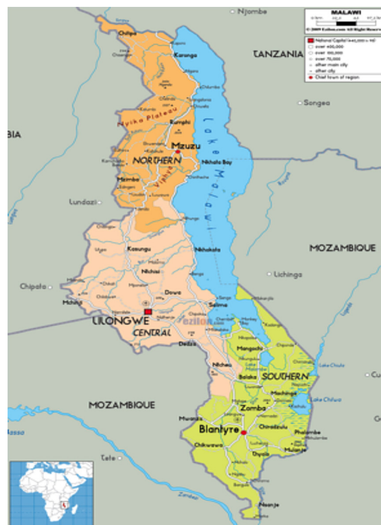
Fig. 1: Geographical location of Malawi. Malawi is located in southeastern Africa, south of the Equator

There have been initiatives to deal with postharvest losses in Malawi in the past. Over the years, several improved technologies for grain storage have been developed and promoted by local research institutions, such as Chitedze Research Station, and development agencies. Adoption of these technologies among smallholder farmers, however, is very limited for a number of reasons: (i) they demand extra labour; (ii) the cost is beyond what farmers can afford; (iii) inadequate promotion of technologies by research institutions and partners; (iv) development of the technologies without the input of the end users; and (v) social-cultural reasons. A most recent initiative is a study conducted in