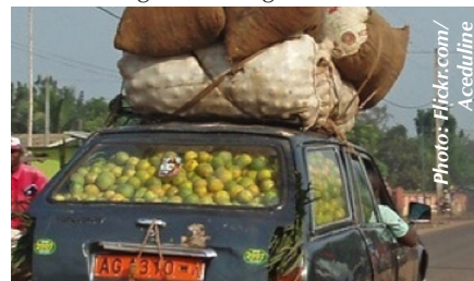
Rough handling hastens deterioration

Fruits and vegetables: Mangoes, oranges, tomatoes and leafy vegetables are important fruits and vegetables produced for subsistence and commercial purposes in Benin. They are marketed mainly in their fresh form in local and regional