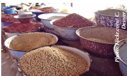
Cowpea grains at the market

Pulses: Cowpea is the most cultivated and consumed legume in Benin. It is produced in four agroecological zones, with Forest Mosaic, Southern Guinea and Northern Guinea Savanna accounting for