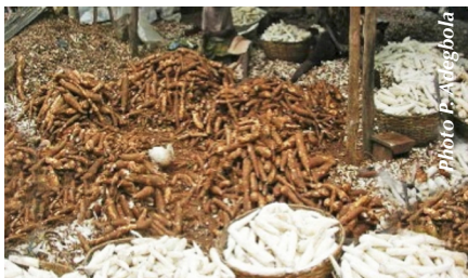
Cassava at a processing centre

Over 80% of cassava production takes place in southern Benin and is dominated by small-scale farmers. Cassava is utilised while fresh, but 70% is processed into dried chips and gari . Cassava processing is predominantly undertaken by women, and by small and middle enterprises. Hermetic storage has been efficient in protecting cassava against storage insect pests.