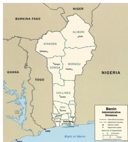
Fig. 1: Geographical location of Benin. Benin is located on the West Coast of Africa

Unreliable PH loss data can deny decision makers the opportunity to optimise their efforts and strategies for preventing PH losses. The International Centre of Insect Physiology and Ecology ( icipe ), with financial support from International Development Research Centre (IDRC) conducted a systematic review of literature for 11 commodities: cowpea, maize, rice, groundnut, tomato, leafy vegetables, mangoes, oranges, cassava, yam and fish, to establish the magnitude of PH losses for these commodities in Benin. A further aim was to unravel the kind of innovations that