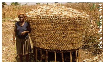
Maize storage barn

Cereals: Maize and rice are the most important cereals in Benin. Maize accounts for 70% of the total cereal production. Production differs depending on the local consumption patterns and comparative advantages of other crops. Producers in northern Benin cultivate maize for commercial purposes while maize is a staple food crop in southern Benin. Maize supply is in-