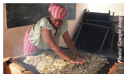
A fish dealer smoking shrimp

Fish: About 25% of the active population in Benin is engaged in fishing. Inland fishing contributes about 80% to the national