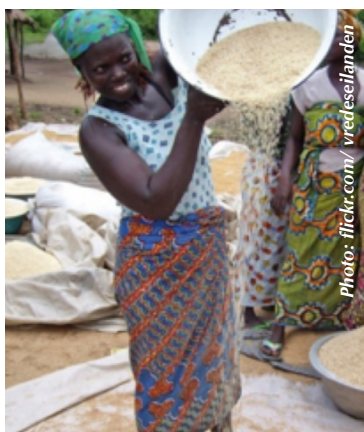
A farmer conducts preliminary processing of rice

fluenced by erratic rainfall patterns leading to spatial and temporal supply. At farm level, storage and preservation are poorly managed by the average farmer. Traditional granaries are still popular among farmers. Several technologies to mitigate losses such as use of resistant varieties, improved wooden granaries, clay granaries, hermetic storage, biological control and the application of chemical protectants and botanicals were promoted in earlier interventions.