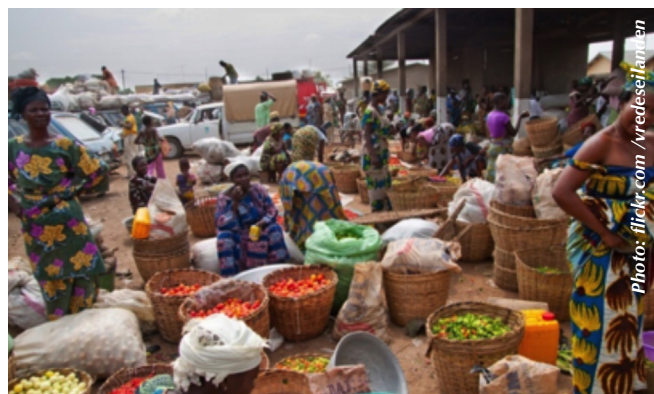
Fresh vegetables at the market

Food markets in many developing countries are undergoing fundamental transitions. Urbanisation and growing middle-class incomes have pushed for new consumer needs, and value chains have evolved to include more and more contribution of value addition activities. There is a growing demand for safe, convenient, nutritious and quality food as well. Thus unlike in the past, strategies for managing PH losses, can no longer concentrate on farm-level activities, ignoring the rest of the PH chain where spatial interactions and value addition are possible.