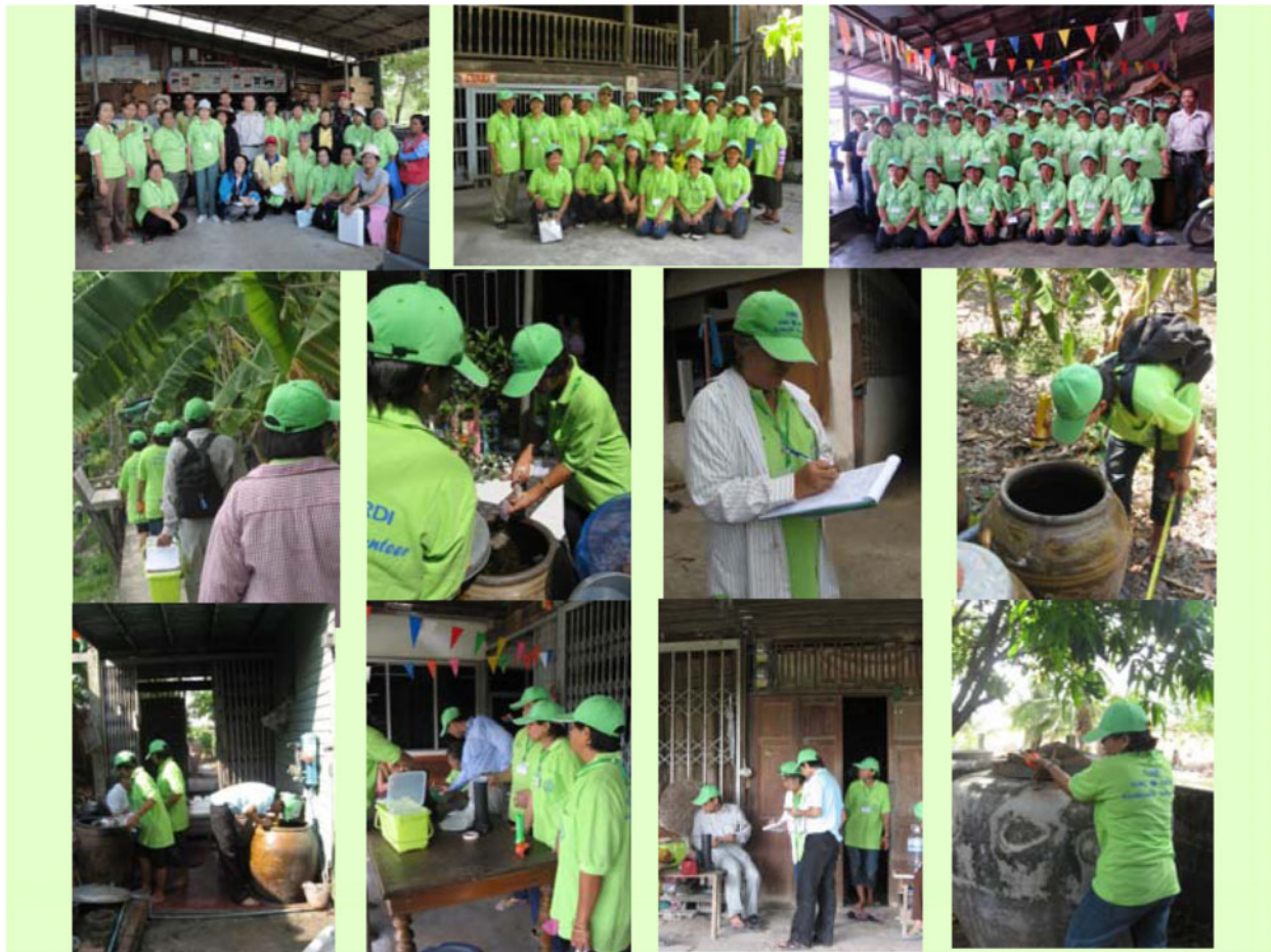
Figure 2 Ecohealth volunteer teams in communities 1, 2 and 3, and vector control activities undertaken in the intervention areas.

and Bti sacs were put into key breeding water containers in the treatment communities (Kittayapong et al. 2008). According to the entomological and household KAP (knowledge, attitudes and practices) survey conducted during Phase I (Arunachalam et al. 2010; Koyadun et al. 2012), these key containers, the containers which mostly found immature stages of dengue vectors, were categorized as cement tanks or basins, various sizes of earth jars, plastic drums or buckets. In this study, Bti sacs or copepods, depending on the choice of each household, were particularly applied into water holding containers that were used daily for general purpose, i.e., bathing, cooking, watering plants, etc., such as cement basins, earth jars, plastic drums, etc. The number of copepods and number of Bti sacs put into these containers, which followed Chansang et al. (2004), depended on the size or capacity of the containers. In addition, MosNet ® , the screen net covers modified from Kittayapong et al. (1993), were introduced to prevent the development of immature Aedes in key breeding water jars that were mostly used for storing and drinking. Source reduction and environmental management, such as getting rid of discarded or unused water holding containers and cleaning solid waste in or around houses and