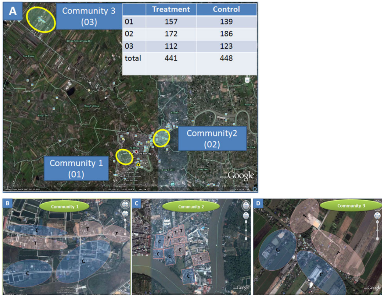
Figure 1 Geographic locations of urban and peri-urban communities in Muang District, Chachoengsao Province (A), showing distribution of treatment (T) and control (C) clusters in communities 1 (B), 2 (C) and 3 (D) respectively. The number of houses in each community is shown in the right hand corner of Figure 1A.

temephos (1% abate sand granules) to control larval stages. However, despite having established intensive vector control programmes and vector surveillance strategies all over the country, suppression of dengue transmission has not been fully achieved, as indicated by the number of reported cases in Thailand over the past ten years (more than 30,000 per year). The lack of efficacy of ultra-low-volume (ULV) and thermal fog application techniques has led to a re-evaluation of recommended strategies for prevention and control of mosquito vectors, and strategies ranging from integrated approaches to community participation have been considered (Gubler & Clark 1996). Moreover, the consequences of intensive use of insecticides have caused insecticide resistance in many insects including mosquito vectors, and insecticide residues retained in the food chain affect many life forms including soil bacteria and plants (Hemingway & Ranson 2000). For these reasons, the trend in dengue vector control has shifted away from the use of chemical-based control to biological-based control and source reduction/environmental management through community participation. In this paper, we