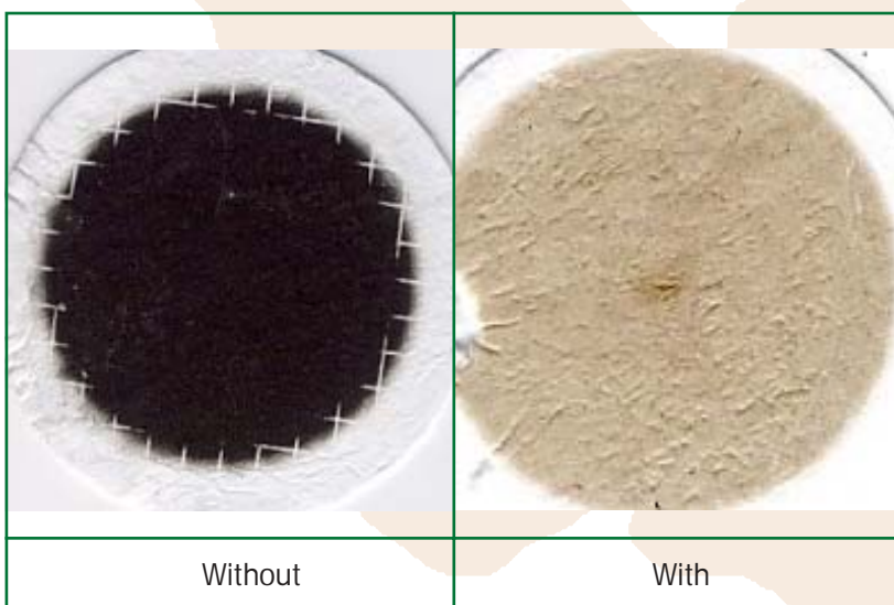
Figure 2: Particles deposited in smoke monitoring filters in with and without intervention households

A cost-benefit analysis was carried out to see whether it makes economic sense for people to install smoke hoods and carry out other anti-pollution interventions. To do this analysis, four benefits of implementing the interventions were highlighted and their economic values calculated. These benefits were: (i) health benefits; (ii) fuel savings; (iii) cooking time savings; and (iv) global environmental benefits due to greenhouse gas reductions.