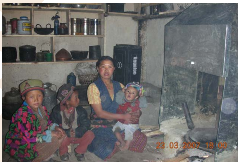
Women cooking - after the intervention

This policy brief is an output of a research project funded by SANDEE. The view's expressed here are not necessarily those of SANDEE's sponsors.