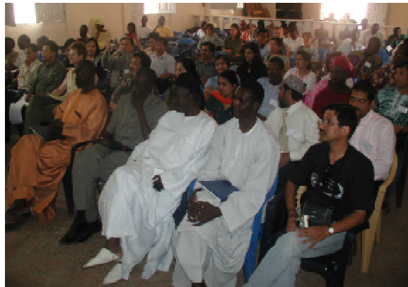
Village officials and sectoral heads/representatives of Tivaouane convened in a forum organized for the visit of CBMS network researchers and invited policymakers in the community.