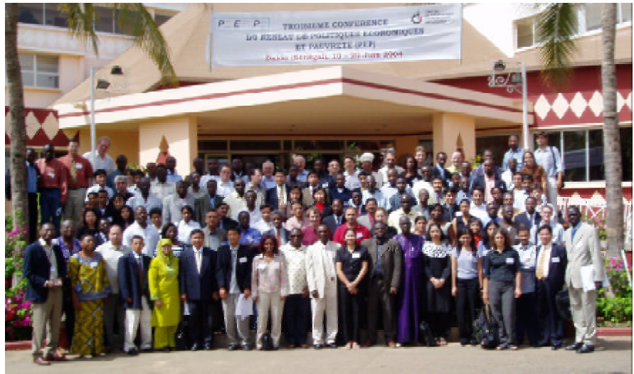
PEP researchers pose for a group picture in Senegal, this year's venue of the general meeting of the network.

This year's PEP general meeting was hosted by the Centre de Recherches Economiques Appliquées (CREA) in