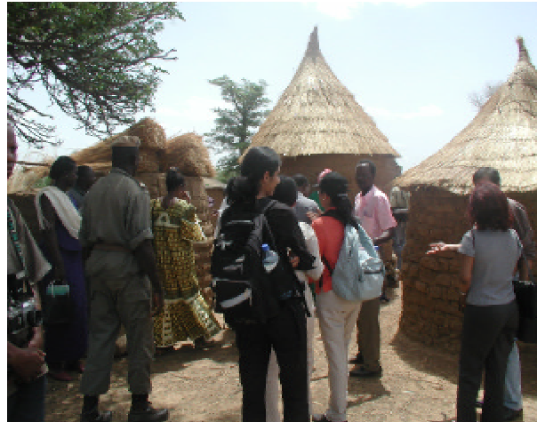
Part of the field visit of the CBMS team in one village in Burkina Faso.

The delegation was then briefed by the traditional chiefs and presidents of the Village Development Committees (VDC) who explained the activities of the CBMS in their