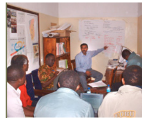
“Gap Facilitation”: RRT members facilitate site-level development of research questions and approaches, learning from site teams through joint reflection and implementation while bringing in new perspectives.