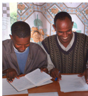
Site team members from Areka Agricultural Research Centre plan for watershed exploration, where the most pressing NRM issues facing communities are diagnosed. As the last site to initiate this activity, the site team benefited from questions and methods developed in other sites yet adapted them to local realities in Areka.

AHI has worked to develop a flexible yet rigorous research and development process grounded in bottom-up learning and innovation as well as regional coordination and mentoring.