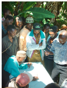
Two learning approaches were triangulated during the watershed exploration phase: Participatory Action Learning to enable local deliberations on watershed problems (above mapping exercise) and Empirical Research in social science in which different social groups were systematically “sampled” to ensure effective representation of diverse views (below).