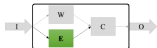
Fig.1 Architecture of MES

MES architecture consists of the main parts (see Fig. 1).