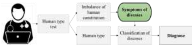
Fig. 2 System in mode A