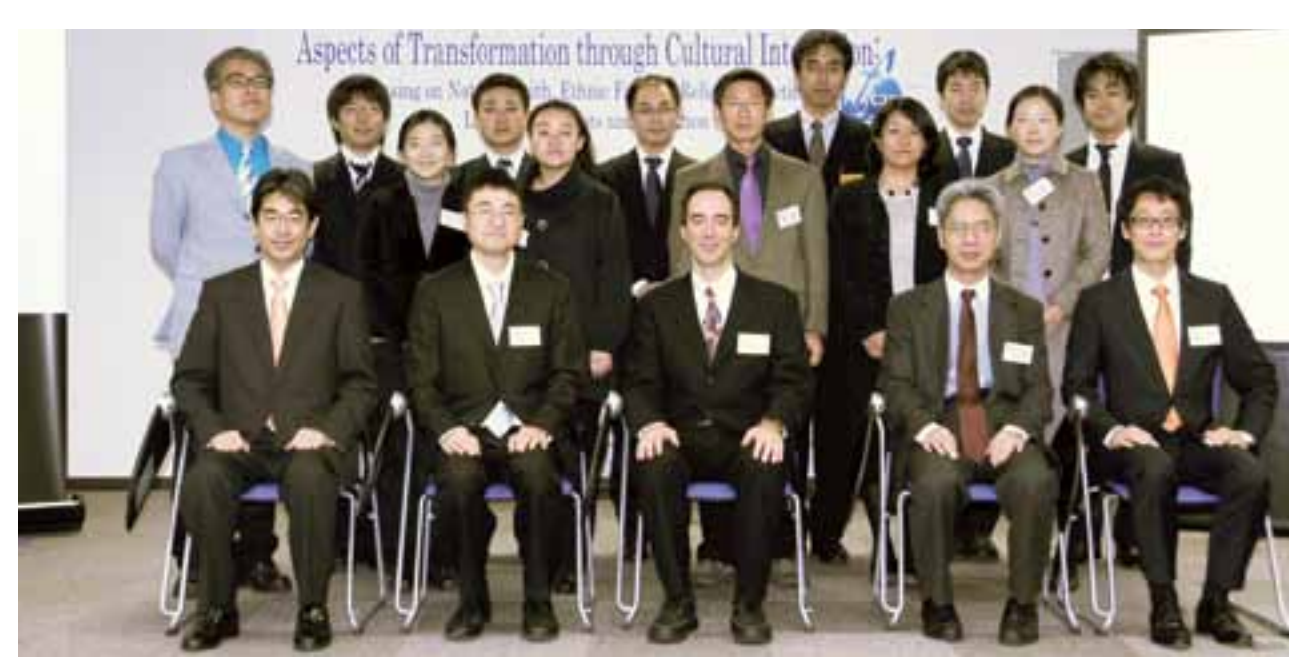
All participants of the forum