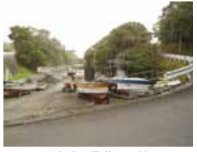
A look at Tōjin machi

this way, a small townscape experienced the transition to the present time.