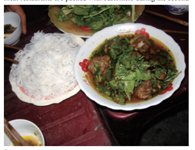
[In Vietnam, stewed dog meat is usually eaten with rice noodles. Dog meat on the bone is delicious!]

Dog meat is a common item in East Asian food. While there might be people who tremble at the words, according to archaeological and documentary materials, the eating of dog meat has a long history in Japan, the Korean Peninsula and Vietnam. It is true that the dog has been the closest pet of mankind since the hunting and gathering age, but the value of its meat seems to have been realized long ago. While pot dishes of dog meat in the Korean Peninsula and Guizhou, China, are well known, scenes of selling dog meat are also found in medieval Japanese picture scrolls. In Vietnam, there are villages where dogs are raised for their meat, which is also sold in markets. In dog meat restaurants, dog meat is served in various ways in stews and soups, as roast minced meat and in sausage dishes. It is usual to eat dog meat garnished with lemon grass and other herbs. Among these various dishes, the sausage dish is the alpha plus. There is even an expression claiming: "Death should be refused if one has not had dog meat sausage!" It is interesting that Kinh Vietnamese (the majority ethnic group of Vietnam) believe that it is unlucky to eat dog meat during the first half of the lunar year, so dog meat restaurants are packed with customers during the second