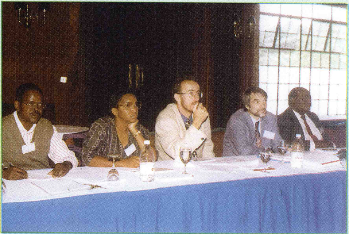
Concentration time during the presentations