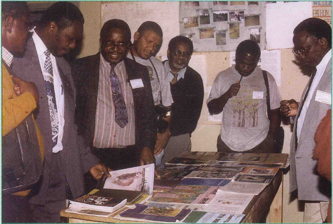
A resource room in the school with a collection of EE materials