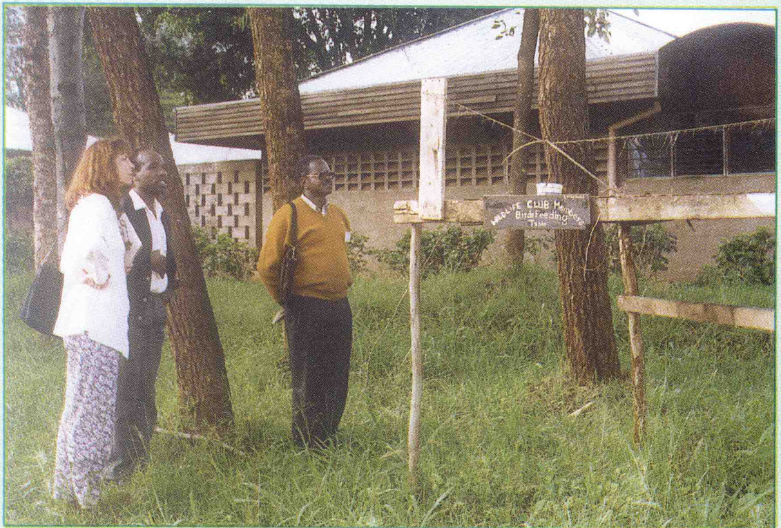
Some of the activities that the students are engaged in – A bird feeding table which attracts birds of all kinds, enriching the biodiversity of the area