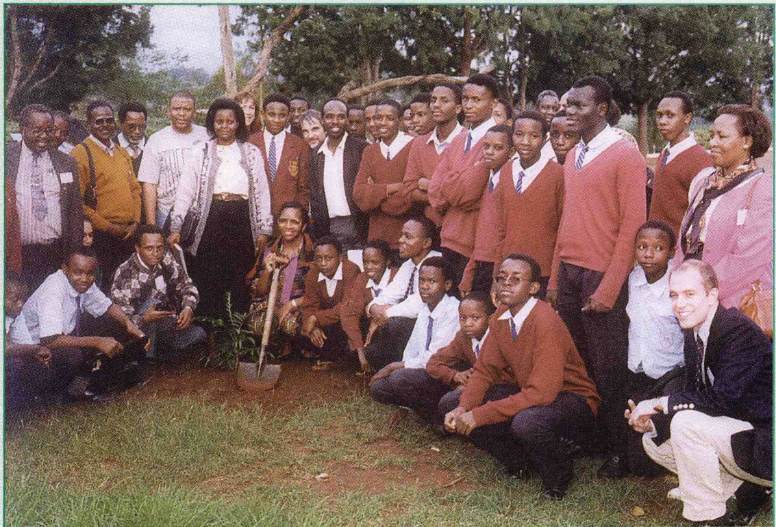
A link was forged between participants and the students of Kiambu High School. At the centre is a memorial tree – the Thika Palm, which the participants planted at the school compound