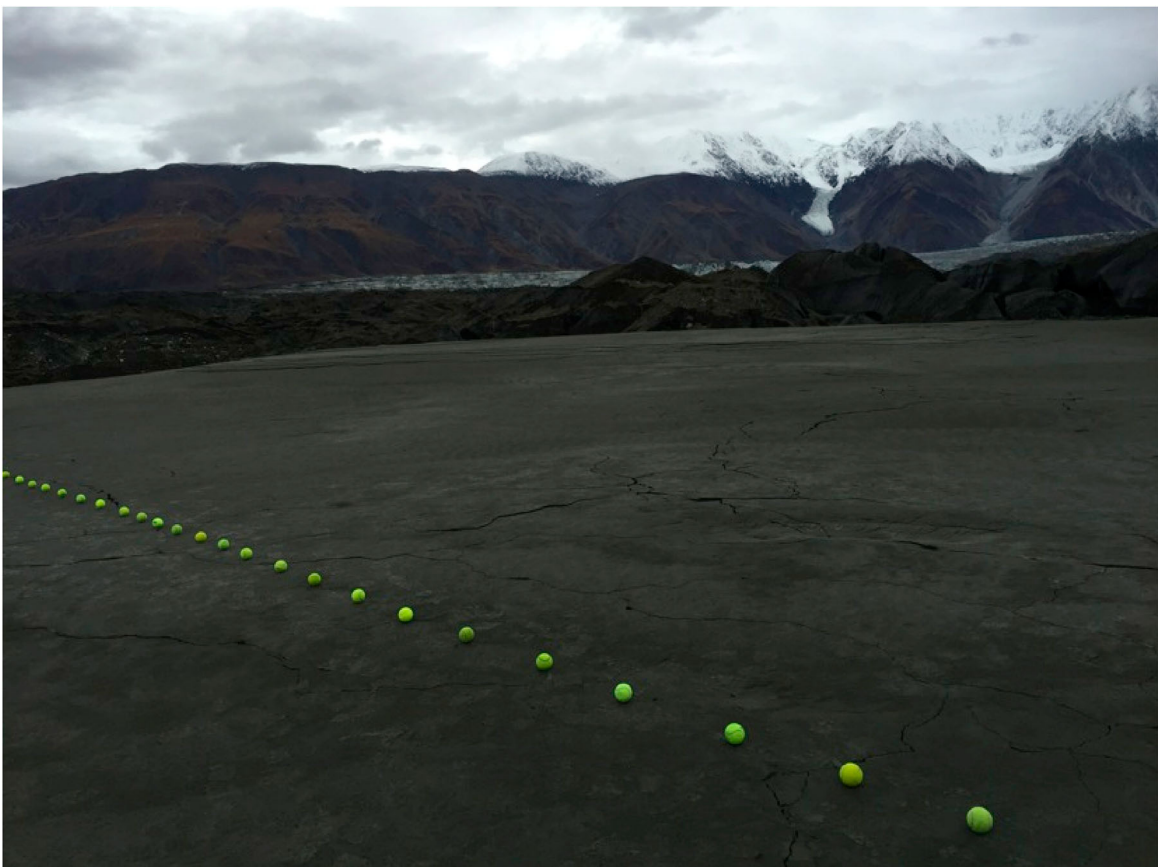
Figure 5. 'Yukon Flux' – view up Slims River valley to Kaskawulsh Glacier. The fluorescent balls contrast with the dark surface, emphasizing the instability of the ice that lies below. Art image © 2016 K.A. Colorado.