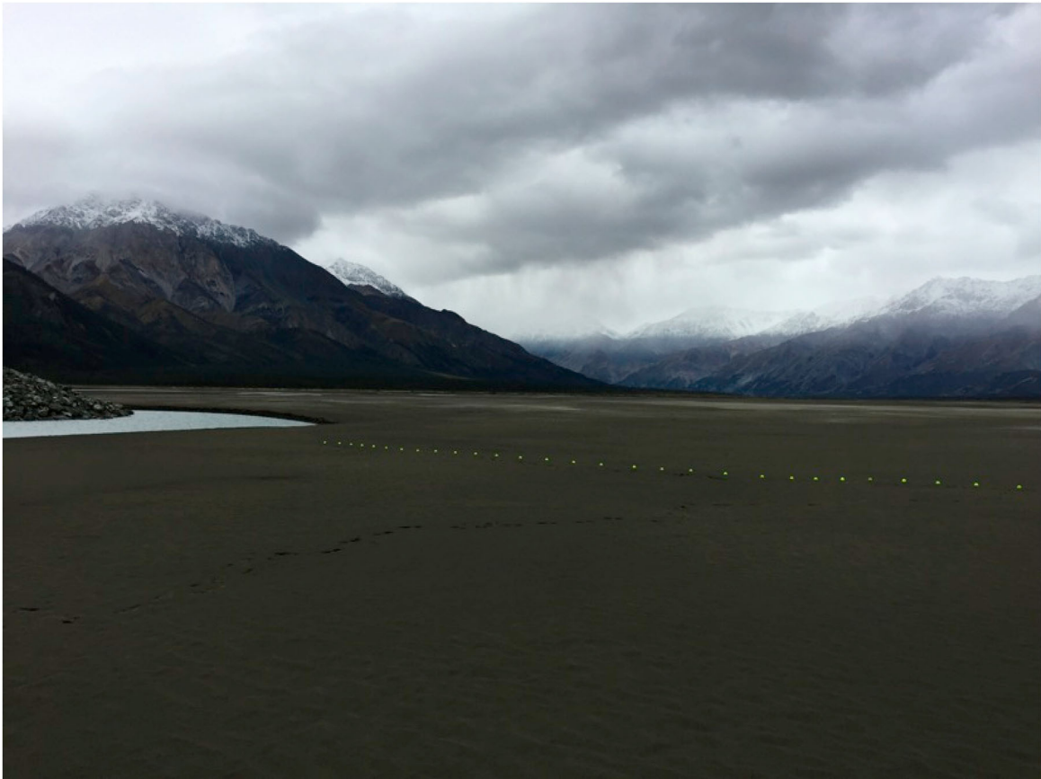
Figure 4. 'Goodbye Slims' – Slims River valley view. This art installation leads the viewer's eyes to the former channel of Slims River, which was abandoned due to retreat of Kaskawulsh Glacier. Art image © 2016 K.A. Colorado.