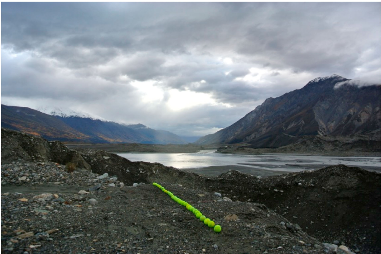
Figure 10. 'Dominion' – boundary line to the glacier. The art installation is positioned in an area of sediment covering the dead toe of Kaskawulsh Glacier. Light from the sky reflects from the remnant of Slims Lake, creating a silhouette of the mountain range. Art image © 2016 K.A. Colorado.