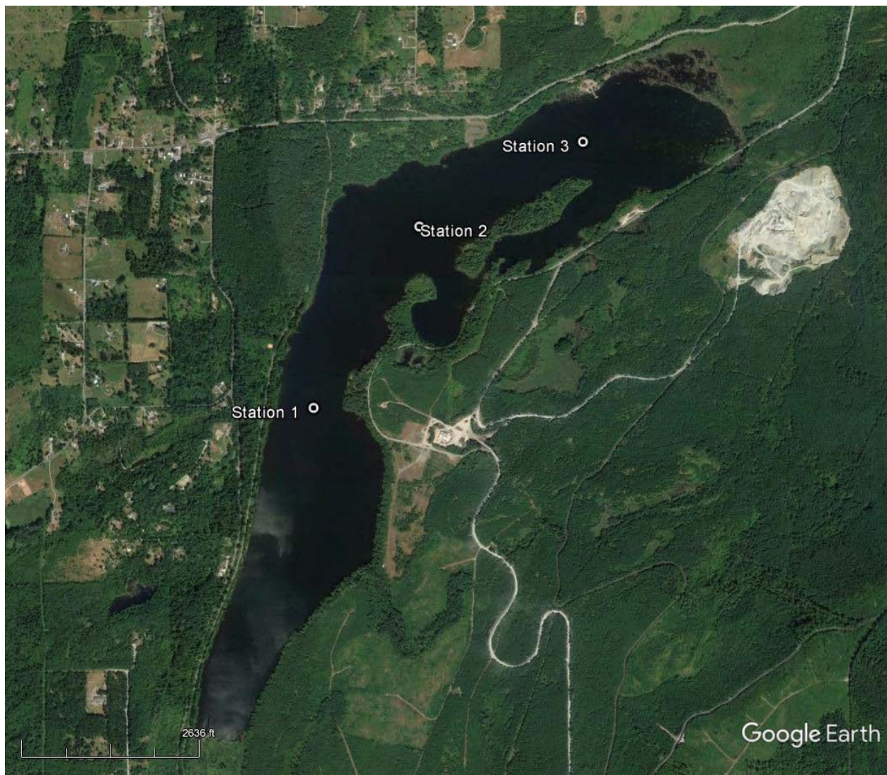
Figure 1: Map of Lake Kapowsin showing UWT sampling locations.

Sampling was conducted by UWT staff once a month from three stations located along the center line of the lake [Figure 1] from June-October 2016. The parameters listed below were collected at each station once a month.