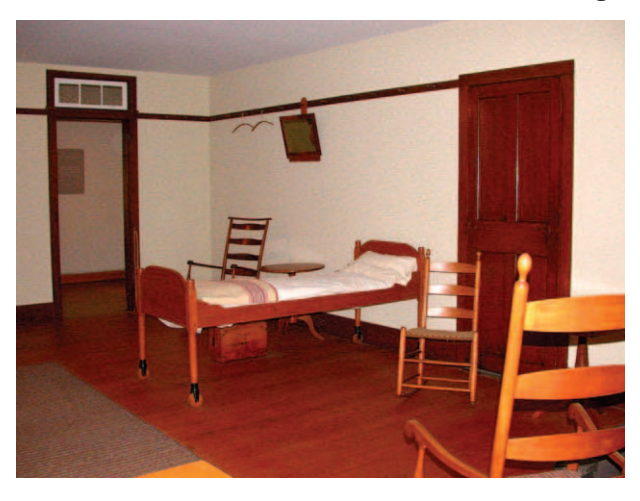
Fig. 5. Sisters' Retiring Room as installed at the Philadelphia Museum of Art, 2005.

As installed, the room reflects changes that took place within this space over time. In the 1830s the Shakers began covering their wood floors with rugs and carpets; Henry De Witt, a Shaker brother living in Mount Lebanon, painted a large carpet cloth for the ministry elders and eldresses there and a smaller one for another location.<sup>3</sup> In May 1851 the sisters of the North Family finished hanging blinds, actually wooden shutters,