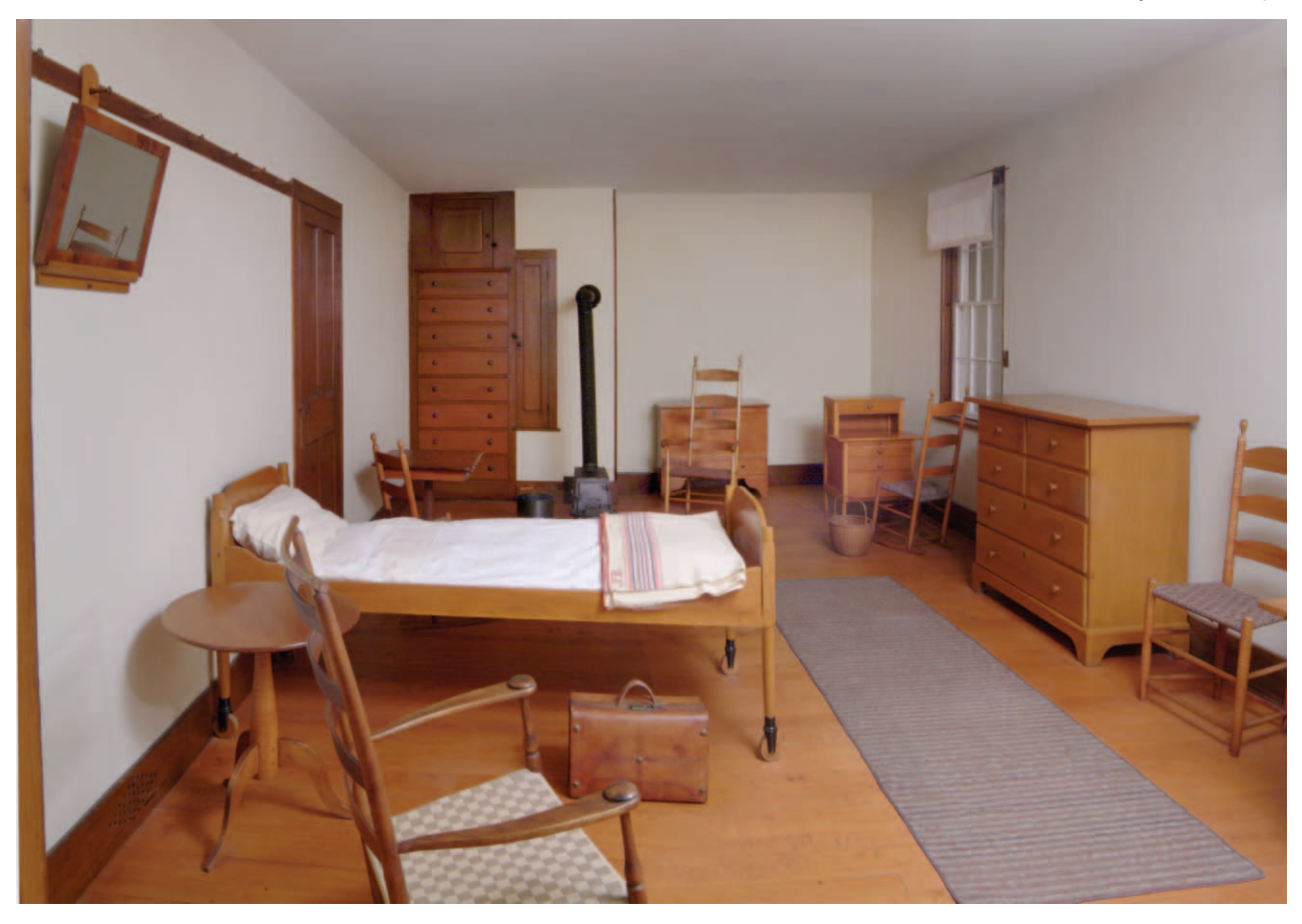
Fig. 1. Sisters' Retiring Room, Mount Lebanon, New York, ca. 1845, as installed at the Philadelphia Museum of Art, 2005.

mid-twentieth-century interpretation of Shaker design.