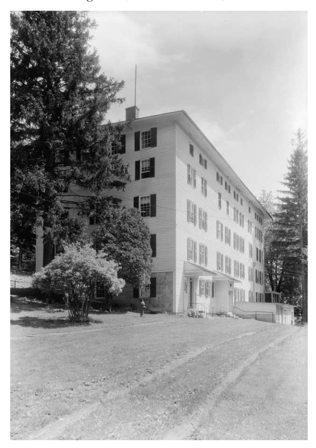
Fig. 4. West (rear) and north exterior, North Family Dwelling House, Mount Lebanon, New York, 1818–63 (demolished 1973), photo 1930.

the woodwork, as well as the location of the woodwork and other architectural elements, appear to represent accurately those of the original room. The entrance door, closet door, and two windows correspond to their original locations in the North Family Dwelling. A window on the wall opposite the entrance door is missing, however.