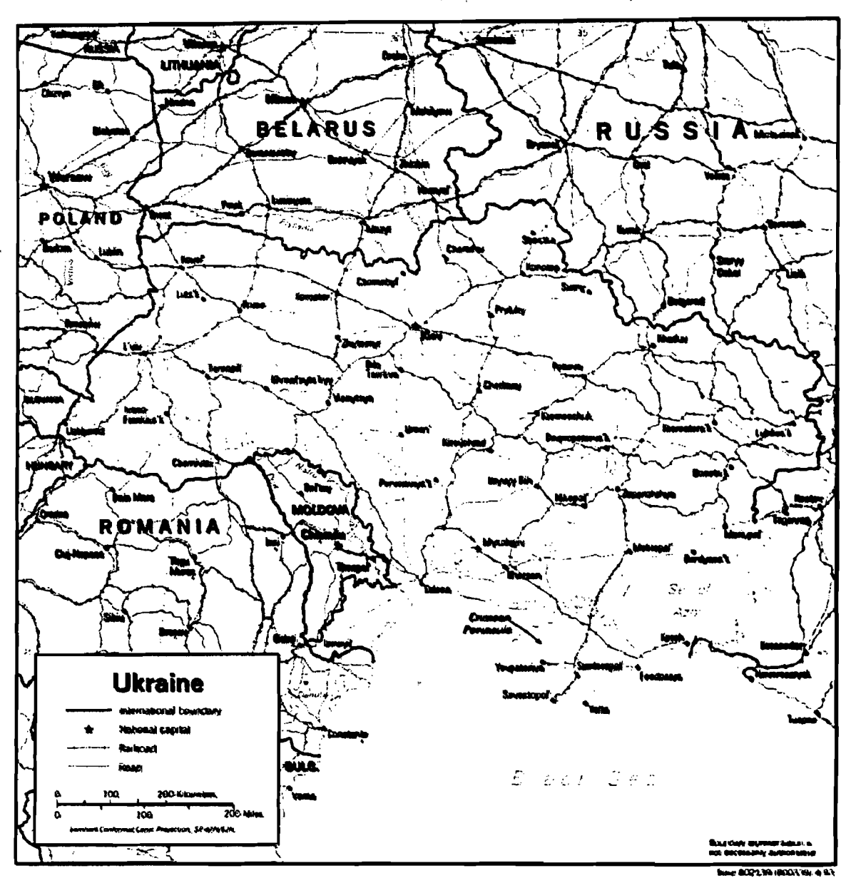
Figure 4.1 – Map of Ukraine