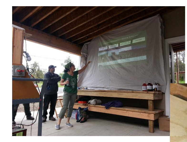
Earth Day April 23, 2016