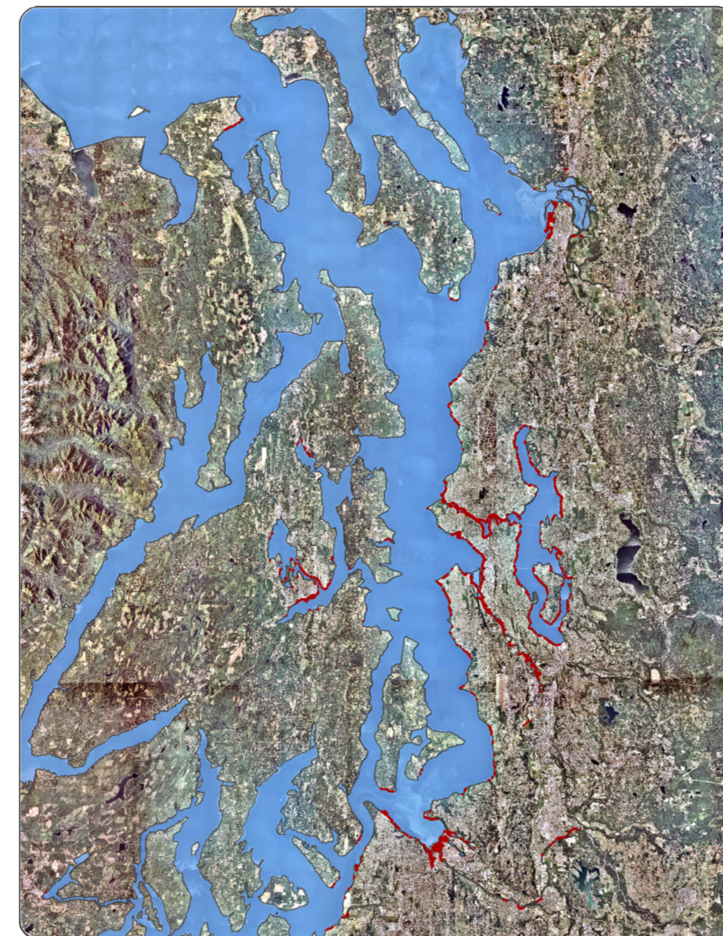
Puget Sound Pollution Hazard Zones (in red)

The planning process began with receiving shellfish poisoning data from a faculty member, Cheryl Greengrove. The original plan was to utilize this data with Puget Sound water quality data in a raster analysis and to create a base map to accomplish this analysis within. However, spatial coordinates for the dataset were not available. Upon further discussion, the focus of the project turned to developing a substantial base map for the Puget Sound. This base map would include layers from the built environment and natural environment. The built environment facet would include a population density raster and a development layer. The natural environment facet would include a combined topography and bathymetry layer and a land cover layer. Preliminary speculation pointed to government agencies as sources of relevant data. Universal Transverse Mercator was selected as the coordinate system because it was able to cover the entire extent of the Puget Sound. An additional element of analysis was added to the project through brainstorming with my small group. This analysis would include impervious surfaces, slope, and population density to determine potential pollution hazard zones to the Puget Sound.