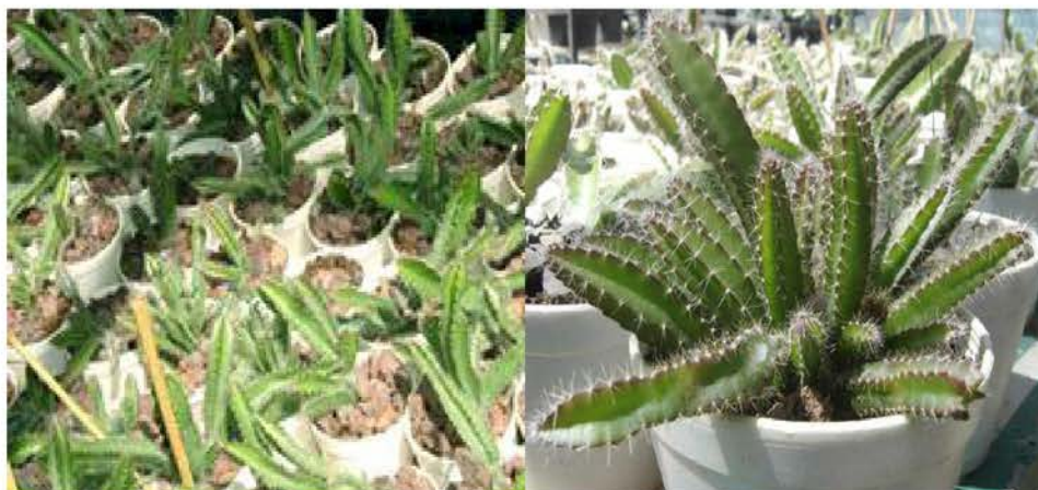
Figura 3. Hylocereus purpusii plants obtained via organogenesis in acclimatization conditions after six months of culture.

Means with different letters in the same column differs for p < 0.05 according to Duncan test