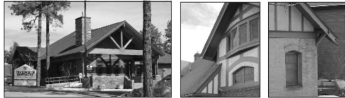
Local example of the use of a combination of materials.