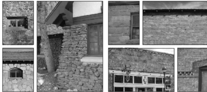
Local examples of the use of brick, stone, rusticated block. Also note window type, proportions, and details.