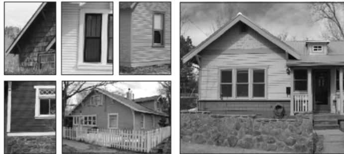
Local examples of the use of horizontal lap siding and wood shingles, note the appropriate use of color on the siding and trim. Also note window type, proportions, and details.