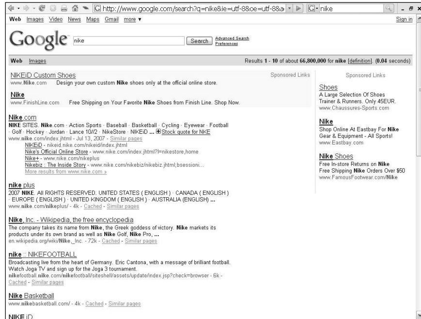
Figure 4 A 2007 search for “nike” produces two sponsored links that appear above the organic listings (these are lightly shaded in a highlight color) and three sponsored links on the right side of the page. The organic results are dominated by the websites of the Nike™ athletic wear company.

Figure 4 shows Google’s results page for “nike.” “Nike” is apparently understood by both Google’s algorithm and its AdWords advertisers as the proper name of a sneaker company. All the top-page results and AdWords advertisements reflect this meaning of the word. The left column here is somewhat different than the last example because Google has “awarded” two advertisers (Nike and Finish Line 72 ) with top left-column placements for their advertisement, which appear above the left-column results. 73 The standard left-hand column