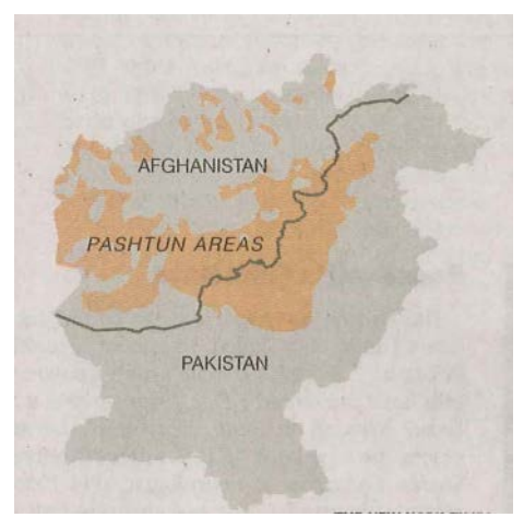
Fig. 1. The Durand Line and the Pashtun Areas <sup>10</sup>

They never will." An American military officer complains: "The only ones who recognized the border were us, with our G.P.S." Some describe the Durand Line as one "drawn on water." Perhaps, but it has been on fire for over a hundred years.