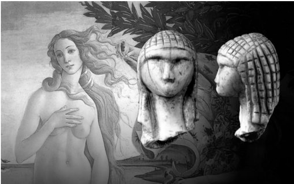
Figure 3 – Aesthetic perception and expressions of symbolic thought across time in Homo sapiens : just a naïf suggestion.