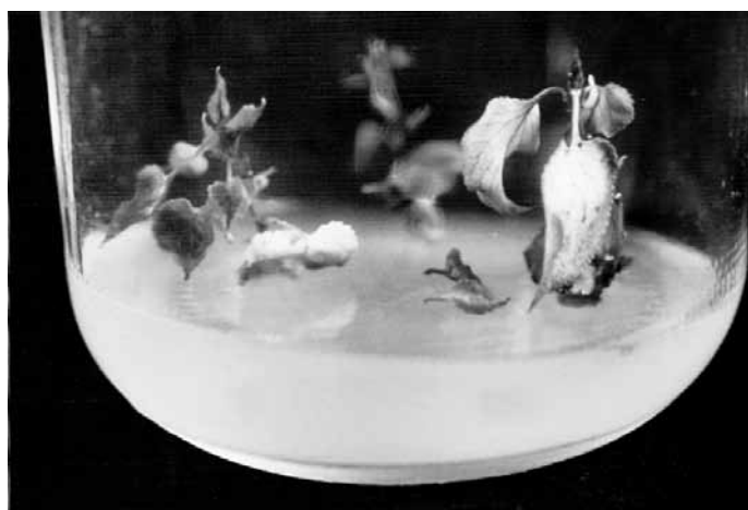
Fig. 2 - Effect of gamma irradiation 100 Gy, six weeks after the treatment on in vitro apricot shoot.

Means within a column or a row followed by the same letter(s) are not significantly different at the 0.05 level of probability.