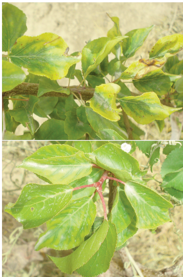
Fig. 2 - Yellowing observed in an apricot accession during sample collection in a National Collection Centre.

All apple and pear plants analysed (180 samples) resulted free from ACLSV, ApMV, ASGV and ASPV. Symptoms such as yellowing, leaf distortion and puckering were observed in some stone fruit plants during collection of the 5521 samples that were tested by DAS-ELISA (Fig. 2). Among them, 23 (0.4%) samples collected from several MSNs in Kabul, Khandahar, Parwan, Herat and Baghlan provinces resulted positive to ACLSV. In particular, there were two plants of European plum (Clone 364/local name Alu BokharaShalili), one cross of Myrobalan and Japanese plum (4031/Grangej Zard), 17 plants of peach (five from 804/Turki Sorkh, five from 812/Dir Ras and seven from 811/TurkiZard), one plant of almond (159/Sattarbai Bakhmali) and two plants of apricot (373/Shakarpara and 4037/Aqa Banu). Two (0.03%) almond samples, both collected from the NCC in Balkh province, resulted infected by ApMV; in was interesting that one of them also tested positive to PNRSV. Analyses against PNRSV evidenced 38 samples (0.6%), collected from NCCs or MSNs located in Balkh, Herat, Kabul, Khandaharand Paktya as infected by the virus (13 almond, five plum, nine peach, and 11 cherry plants). Finally, one plum sample (cv. Alu Bokhara Shalili), from a MSN in Kabul, resulted infected by PDV while none of the stone fruit samples tested resulted positive to PPV (Tables 2-6 and Fig. 3).