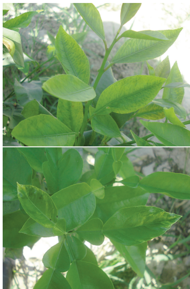
Fig. 4 - Vein clearing and yellowing symptoms observed in citrus accessions collected from the National Collection Centre in Jalalabad (Nangarhar province).

In particular, regarding ACLSV isolates, a 677-long nucleotide fragment, corresponding to partial coat protein gene, was amplified from all ELISA-positive samples by RT-PCR using ACLSV sense and antisense primers (Menzel et al. , 2002). Eleven of the identified isolates of ACLSV were then characterized molecularly. Sequence analysis revealed similarity ranging from 83.6 to 100.0% within ACLSV isolates detected in Afghanistan. Blast analysis showed that sequences of two peach isolates, 812/Dir Ras, shared the highest nucleotide similarity (95.8 and 96.2%) with the GenBank ACLSV isolates Apr 3 from Jordan (AJ586631). Moreover, the same Afghan isolates showed nucleotide identity between 95.0 and 95.7% with isolates S4, PP23, PP63, and HL2 (JN849008, GU327991, GU328003 and GQ334211, respectively) from China. Sequence analysis of isolate 364/Alu