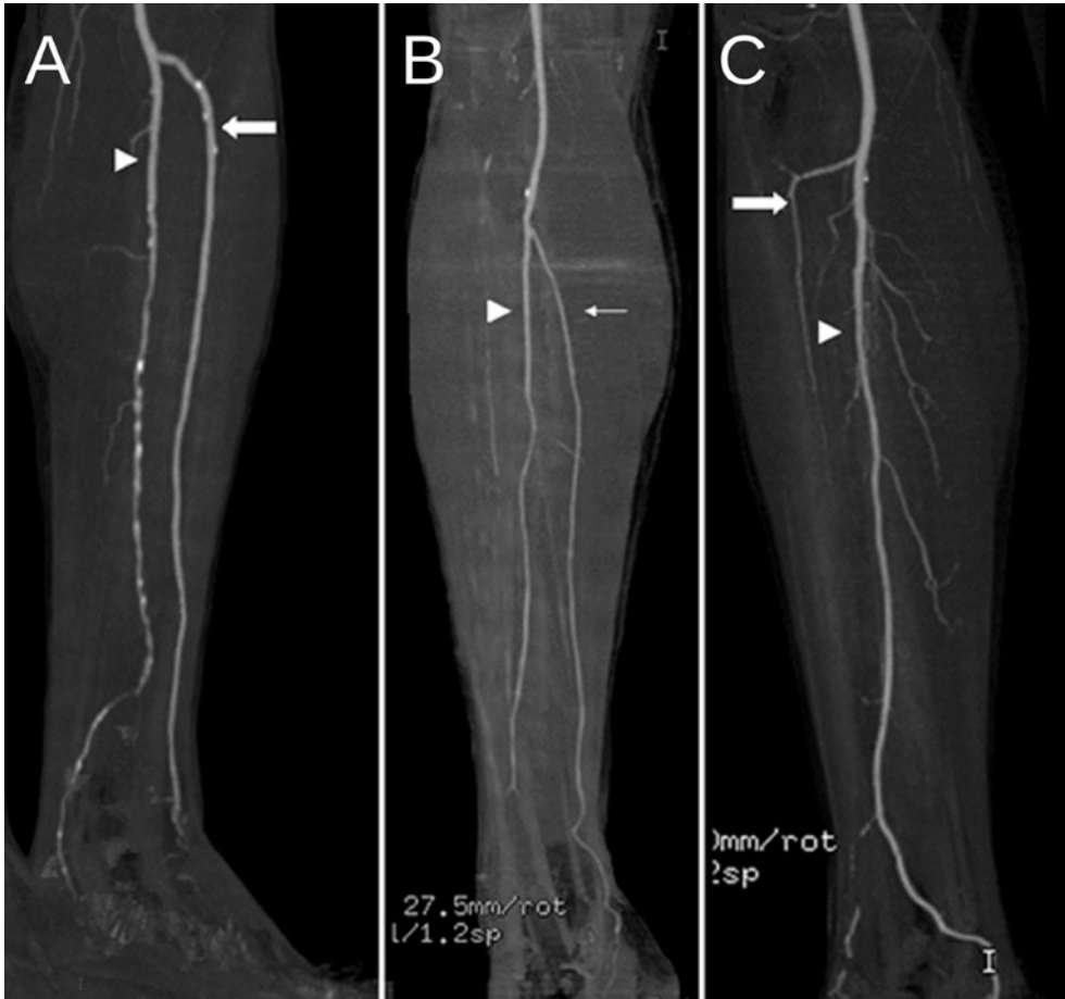
Figure 3. Type III branching patterns in maximum-intensity projection images. A) Type IIIA pattern in the left lower extremity. B) Type IIIB pattern in the right lower extremity. C) Type IC pattern in the right lower extremity. Thick arrow: anterior tibial artery; thin arrow: posterior tibial artery; arrowhead: peroneal artery.

Mavili et al., 2011), and Doppler ultrasound (Tindall et al., 2006). However, contrast enhanced computed tomography angiography (angio-CT) can provide an imaging definition that is as accurate as angiography, with the advantage of being a safer procedure that punctures a peripheral vein (usually at the dorsum of the hand) (Hiatt et al., 2005; Fleischmann et al., 2006).