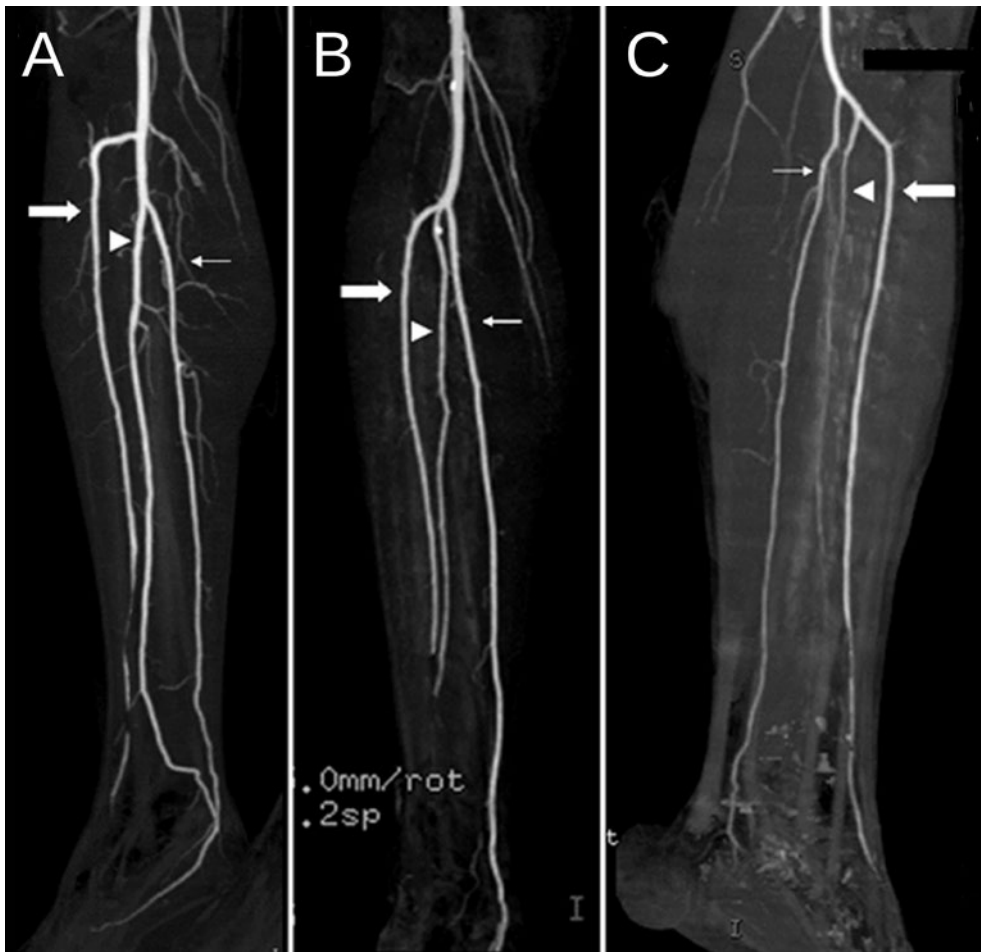
Figure 1. Type I branching patterns in maximum-intensity projection images. A) Type IA pattern in the right lower extremity. B) Type IB pattern in the right lower extremity. C) Type IC pattern in the left lower extremity. Thick arrow: anterior tibial artery; thin arrow: posterior tibial artery; arrowhead: peroneal artery.

tions of the popliteal vascular branching is mandatory in surgical procedures and radiological diagnosis. In this context, Kim et al. (1989) classified the popliteal vascular branching patterns into the following categories (Figs. 1-3): IA: Normal level of bifurcation of the popliteal artery (below the knee), with a tibioperoneal trunk length of more than 0.5 cm; the anterior tibial artery is the first branch, and a tibioperoneal trunk follows up to the bifurcation in the posterior tibial artery and peroneal artery. This is the usual pattern. IB: Normal level of bifurcation of the popliteal artery (below the knee), with a tibioperoneal trunk length of less than, or equal to, 0.5 cm. Trifurcation. IC: Normal level of bifurcation of the popliteal artery (below the knee), the posterior tibial artery is the first branch. Anterior tibioperoneal trunk. IIA: