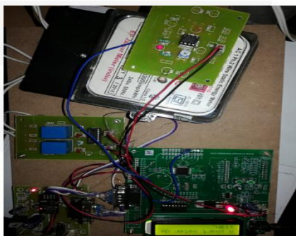
Fig.3.1. Working model.

Smart meters are digital dimension tools made use of by energies to connect details for invoicing clients, track as well as document consumers' electrical usage and also running their electrical systems. With wise meters, sending out information to the electrical power distributor instantly, there would certainly not be the demand to have the meter placed outside the consumer properties. Positioning the meters inside a garage or various other area would certainly supply a far more secured place as well as help in the safety of the wise grid. This would certainly need relocating or prolonging the high-voltage line terminus from their regular place to the inside which would certainly include significant cost, as well as probably be excessive for any type of considerable clever grid tasks. Actually, for any kind of brand-new houses constructed in locations with existing clever meters framework, this might be a beneficial alternative. Information can be sent out wirelessly to an accessibility factor at the power post or using interaction over the reduced voltage high-voltage line.