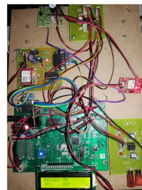
Fig.3.2. Metal detected or IR sensor activated time.