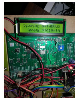
Fig.3.1. Working model.

gizmo, precedes it, and also makes it easily available to truthfully everyone with a GPS receiver. The root cause of building "ARM 7 based completely bomb discovery robotic with online streaming and also tracking" is an endeavour and also even more, study is required to capture the whole capability of comfortable as well as valuable equipments. "As in maintaining with the dominating scenario, human dependences on the generation and also fate fads robotics are misting likely to be made use of as an actually ideal alternative to male or ladies in all aspects of presence". Considering that mines usually blow up whenever they catch the lots they might be developed for, as well as although that we've obtained picked the trouble of our Robo-Pi device to be as light-weight as feasible, nevertheless, its flow over the mine earlier than finding it will certainly expose it to too much danger. Thus, the steel detector is constant under of a plastic arm this is connected sideways of the automobile ahead throughout the mine beforehand than the arrival to its area. The GPS guard is furthermore associated at the peak of the arm so the area of the found thing is what to be despatched to the top system and also no more that of the car.